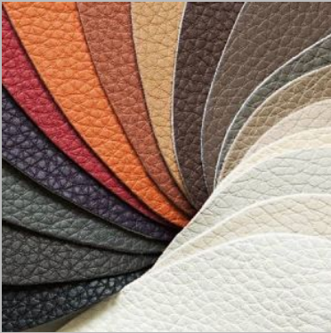
Top Handbag Grain Leather