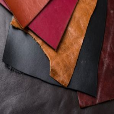
Zug Grain Leather