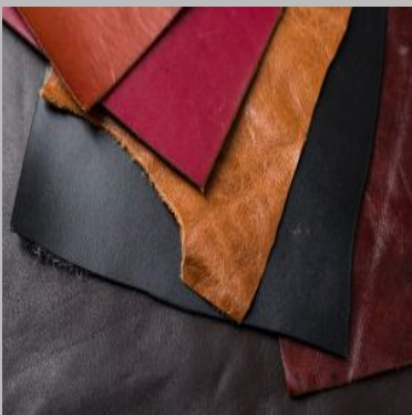
Zug Grain Leather