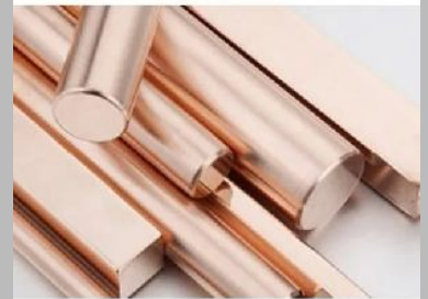
Chromium Zirconium Copper Rods