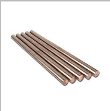
Tungsten Copper Rods