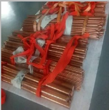
Zirconium Copper Rods