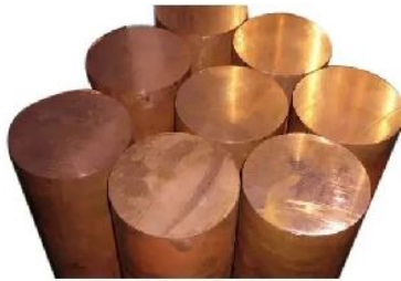
Chromium Copper Rods