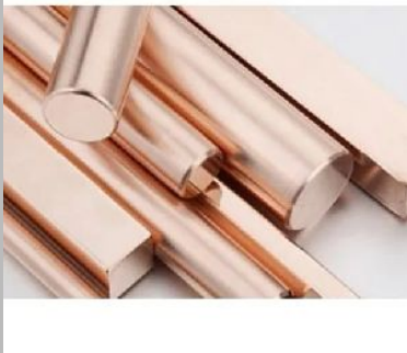
Chromium Zirconium Copper Rods