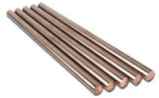
Tungsten Copper Rods