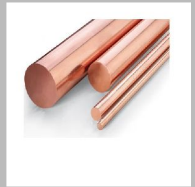
Cobalt Copper Rods