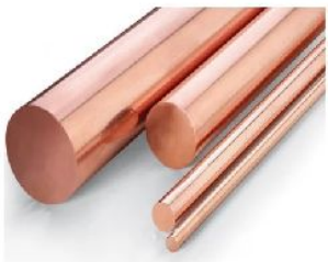
Cobalt Copper Rods