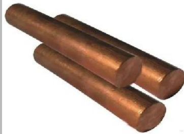
Beryllium Copper Rods