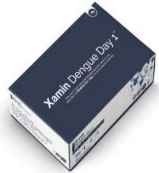
Diagnocure Dengue NS-1 Rapid Test Device