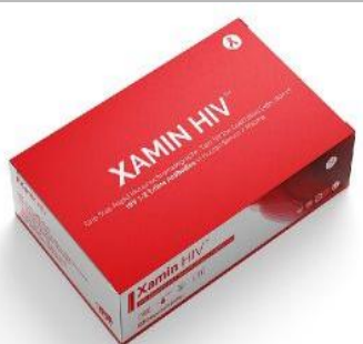
Diagnocure HIV 1 & 2 Rapid Test Device