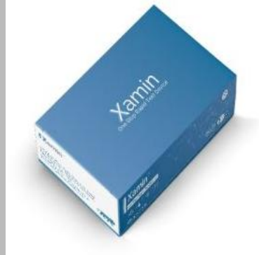
Diagnocure Leptospirosis IgG & IgM Rapid Test Device