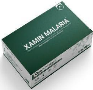
Diagnocure Malaria Pf & Pv Antigen Test Device