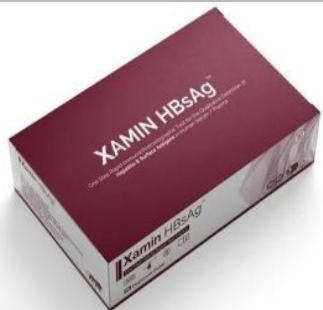
Diagnocure One Step HBsAg Rapid Test Device Kit