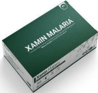
Diagnocure Malaria Pf & Pv Antigen Test Device