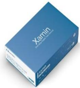
Diagnocure Syphilis Rapid Test Device