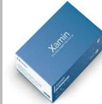
Diagnocure Chikungunya IgG & IgM Rapid Test Device