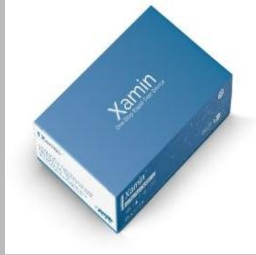
Diagnocure Troponin-1 Rapid Test Device