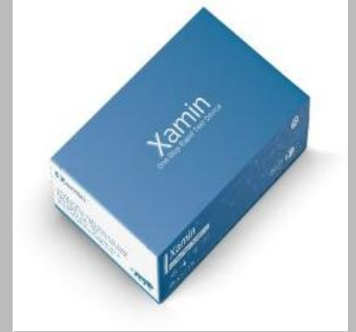
Diagnocure Typhoids IgG & IgM Rapid Test Device