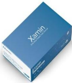
Diagnocure Leishmaniasis IgG & IgM Rapid Test Device