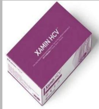
Diagnocure HCV Rapid Test Device