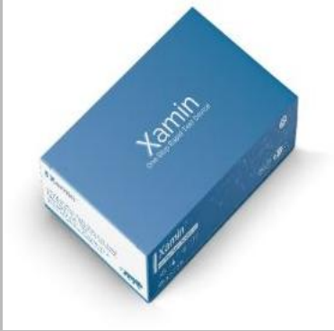
Diagnocure Toxo IgG & IgM Rapid Test Device