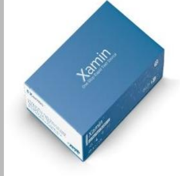
Diagnocure Chikungunya IgG & IgM Rapid Test Device