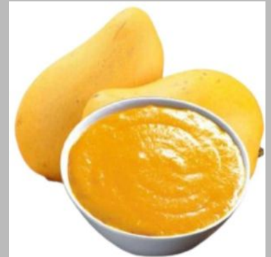
Alphonso Mango Pulp