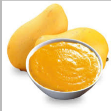
Totapuri Mango Pulp