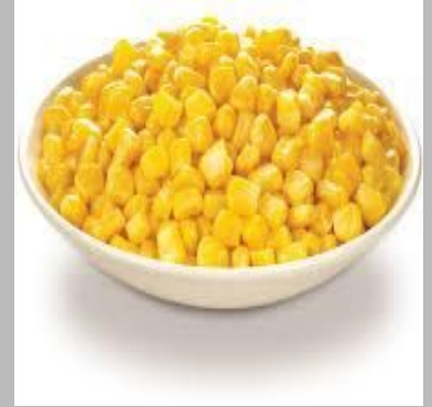
frozen american sweet corn