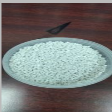
anti block masterbatches