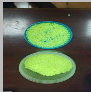
Optical Brightener Masterbatch