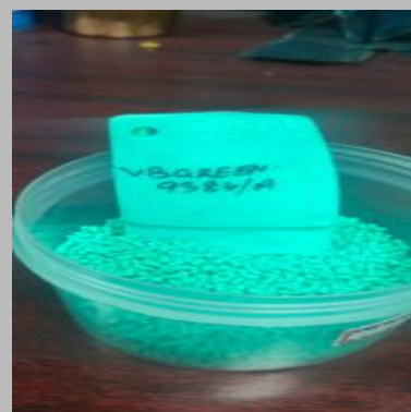
composable master batches