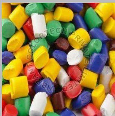
Special Effects Masterbatch