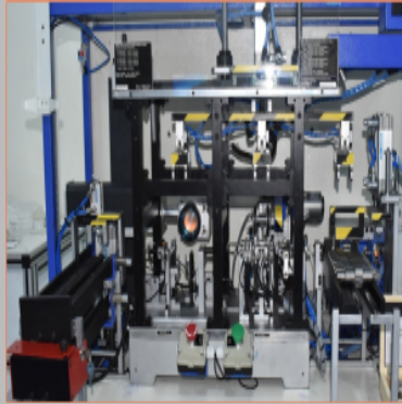
multi gauging system