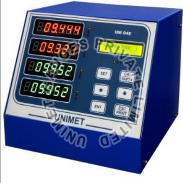
Controller based Readout System