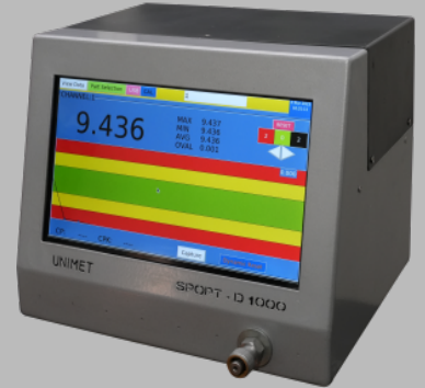
Multi channel readout for gauging