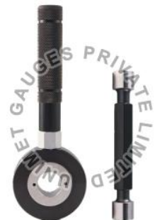
Air Ring Gauge