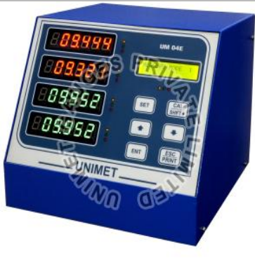
Controller based Readout System