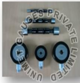
Air Plug Gauge