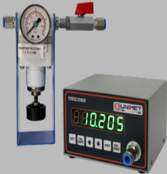
Single channel readout

We Unimet Gauges Private Limited are a leading and distinguished Manufacturer, Exporter, Supplier, Distributor and Retailer of quality Auto Gauging System, Conventional Gauges, Electronic Readouts, Sensors and Transducers, Gear Testing Equipment and Measurement Gauges & Fittings.