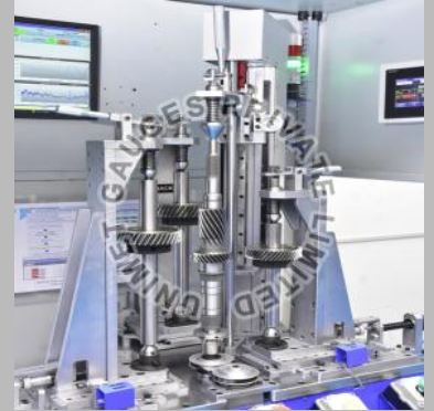
Gear roll tester