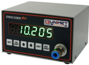
Single channel Readout Pro