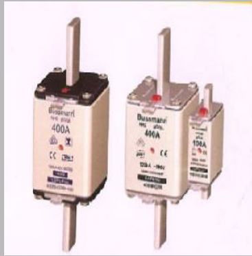
NH Din Industrial Fuse