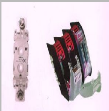
NH Din Fuse Base