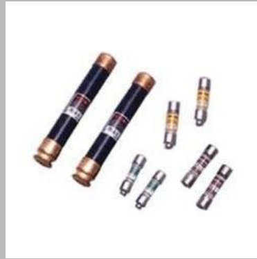
North American LV Industrial Fuse Link