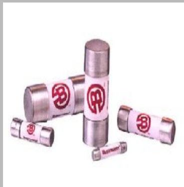
Ferrule Type High Speed Fuse