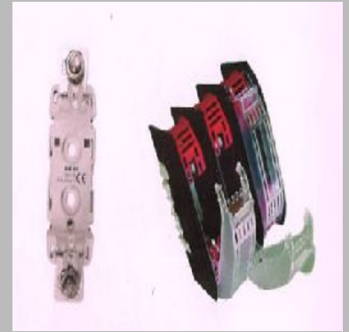
NH Din Fuse Base