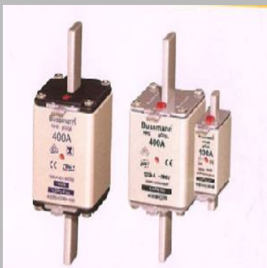
NH Din Industrial Fuse