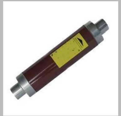
High Voltage Fuse