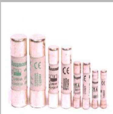
IEC Cylindrical Fuse Link