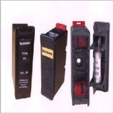
Safeclip BS FUSE Holder