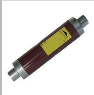
High Voltage Fuse