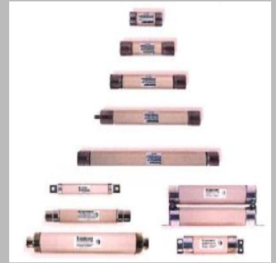
MV Motor Protection & PT/VT Fuse