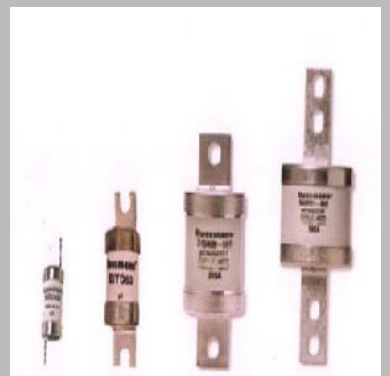
BSLV Industrial Fuse