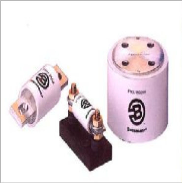
North American Style High Speed Fuse