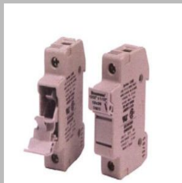
IEC Cylindrical Fuse Holder