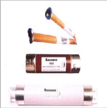
Oil & Air Application HV Fuse