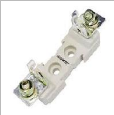
HRC Fuse Base

We Tristar Engineering are a leading and distinguished Exporter, Supplier, Retailer and Distributor of quality Buttons, Electric Fittings and Components, Electronic Fuses, Fuse Holder and Fuses, Circuit Breakers & Components.