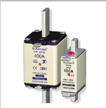
HRC Cartridge Fuse