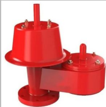
Pressure Vacuum Relief Valve