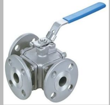
Stainless Steel Three Way Ball Valve