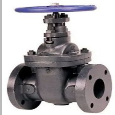
Flanged Gate Valve