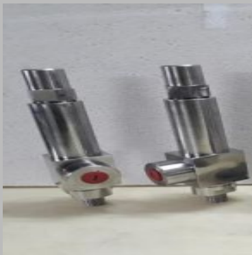
Industrial Safety Relief Valve