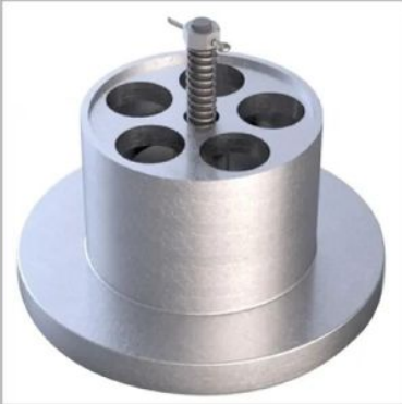
Excess Flow Check Valve