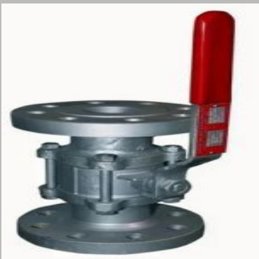
Pneumatic Ball Valve