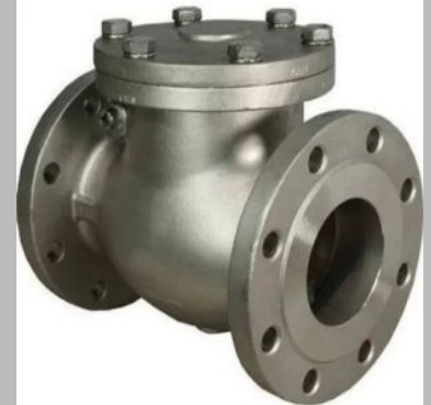
CI Swing Check Valve