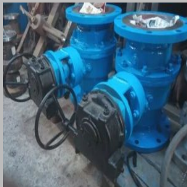
Industrial Ball Valve