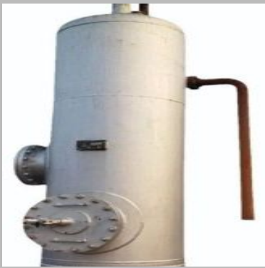
Air Receiver Storage Tank