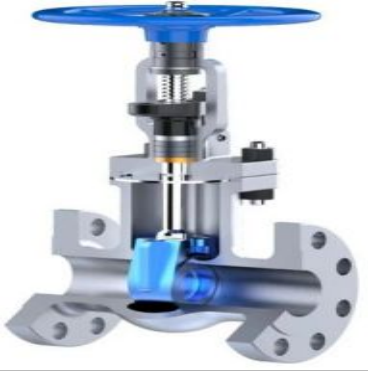
Industrial Gate Valve