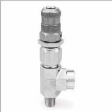
Stainless Steel Pressure Relief Valve