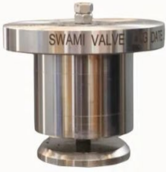
Sandwich Type Excess Flow Check Valve