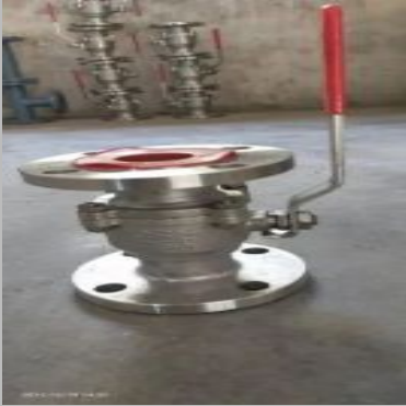
Two Piece Ball Valve