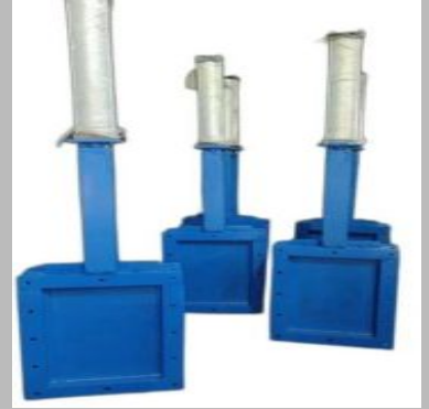
Motorized Gate Valve