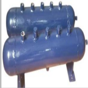
Horizontal Air Receiver Tank