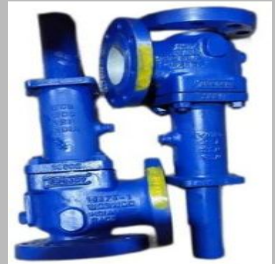
Pressure Safety Valve