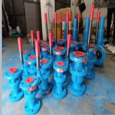
Three Piece Ball Valve