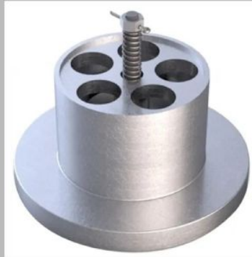
Excess Flow Check Valve