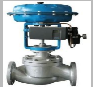
Pneumatic Control Valve