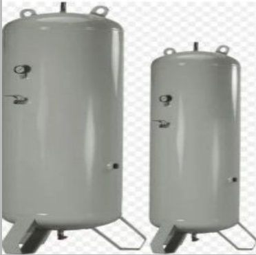
Vertical Air Receiver Tank