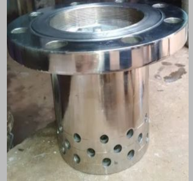
Stainless Steel Foot Valve