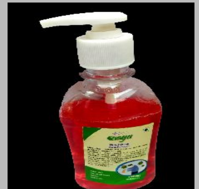
liquid hand wash