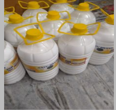
500ml White Phenyl