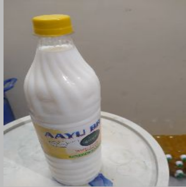
White phenyl 1 Ltr