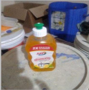
dish wash liquid