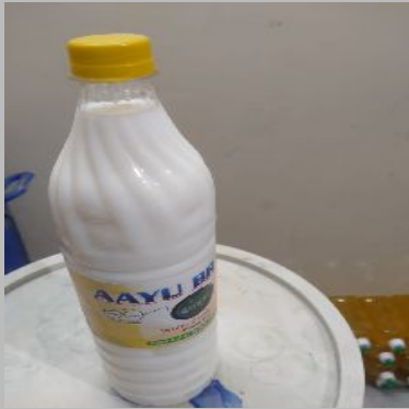
White phenyl 1 Ltr

We Suroliya technologies are a leading and distinguished Manufacturer, Supplier and Service Provider of quality Body & Personal Care Products, Catalysts and Absorbents, Cleaning Chemicals, Cleaning Wipes & Liquids and Commercial Cleaning Services.