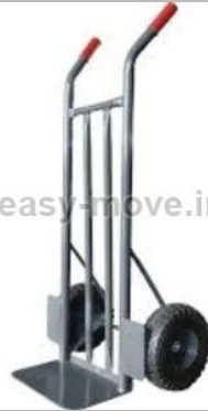
Stainless Steel Hand Trolley