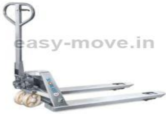
Stainless Steel Pallet Truck