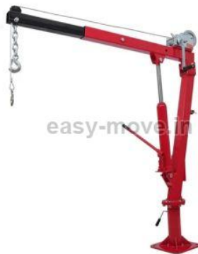
Hydraulic Swivel Crane