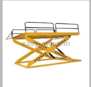
Metal Lift Table