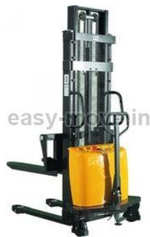
Industrial Hydraulic Stacker