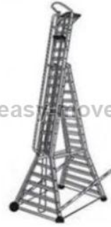
Aluminum Square Tower Ladder