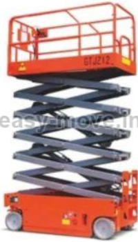
Self Propelled Scissor Lift