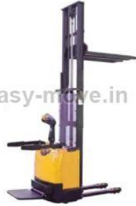
High Lift Power Stacker