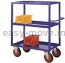
Net Box Hand Trolley