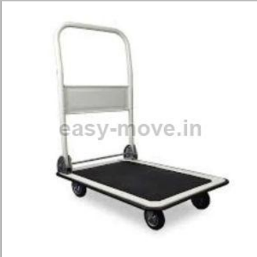
Portable Hand Trolley