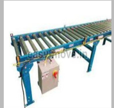
Gravity Roller Conveyor