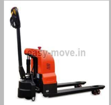
Full Electric Pallet Truck