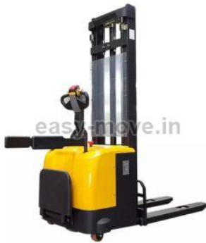
Mild Steel Electric Stacker