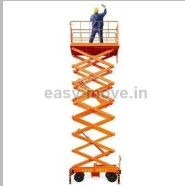
Mild Steel Lift Table