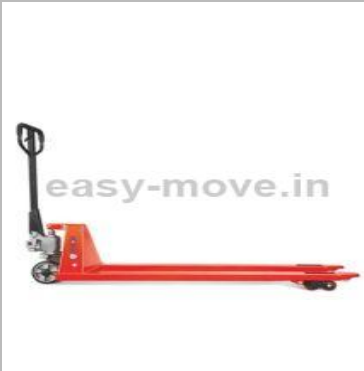
Low Profile Pallet Truck