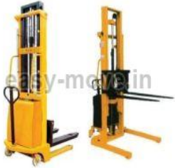
Semi Electric Stacker