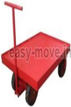
Table Hand Trolley