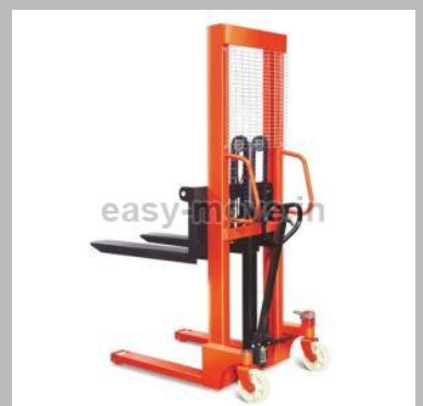
Hydraulic Manual Stacker