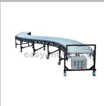
Flexible Expandable Conveyor