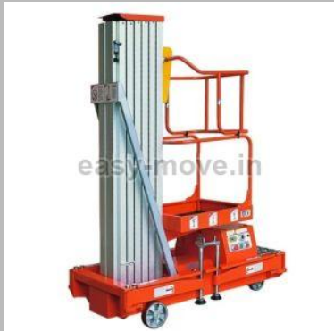
Single Mast Work Platform