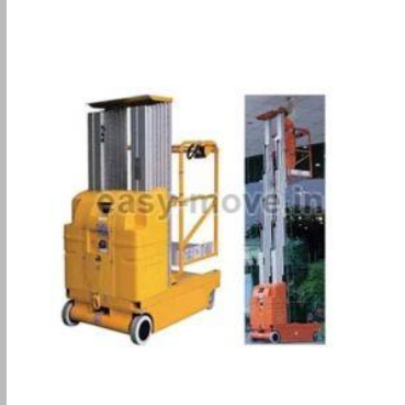
Portable Work Platform