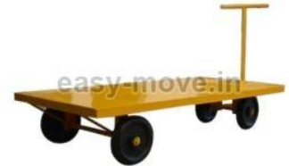
Garbage Hand Trolley