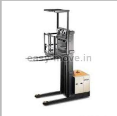
Order Picker Work Platform