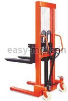
Mild Steel Manual Stacker