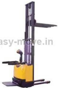
Electrical Power Stacker