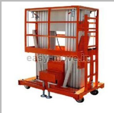
Double Mast Work Platform