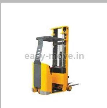
Industrial Electric Stacker