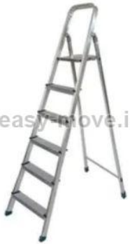
Aluminum Folding Ladder