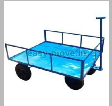
Manual Hand Trolley