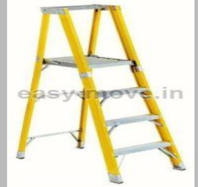
FRP Platform Ladder