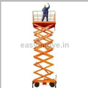
High Rise Scissor Work Platform