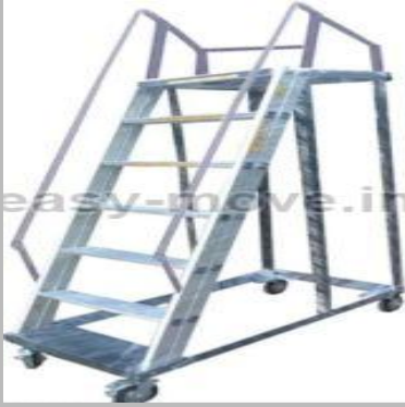
Aluminum Step Ladder