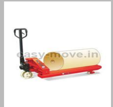
Carrier Pallet Truck