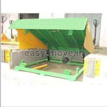
Container Stuffing System