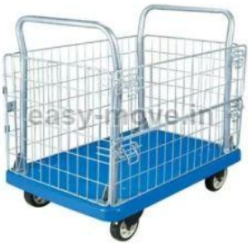
Luggage Hand Trolley