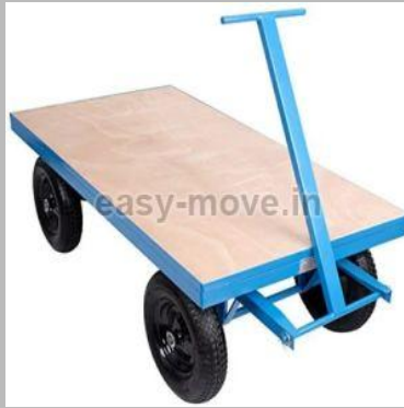
Platform Hand Trolley