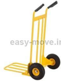
Mild Steel Hand Trolley