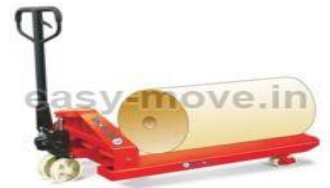
Beam Pallet Truck