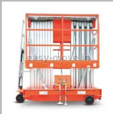
Changeable Work Platform