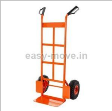
Sack Truck Hand Trolley

We Stacker's & Mover's (I) Mfg. Co. are a leading and distinguished Manufacturer, Exporter and Supplier of quality Airport Equipment, Belt Conveyors, Bulk Handling Equipment, Car Parking Systems and Caster Wheels, Casters & Rollers.