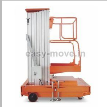
Industrial Work Platform