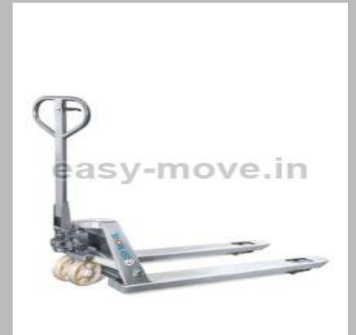
Stainless Steel Pallet Truck