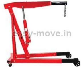
Hydraulic Engine Crane