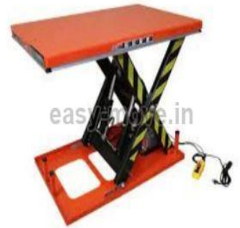
Scissor Platform Lift Table