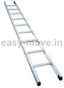
Aluminum Single Ladder