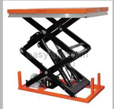
Hydro Electric Lift Table