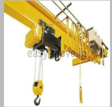
Single Girder EOT Crane