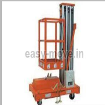
Aluminum Work Platform