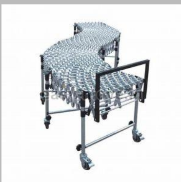
Flexible Skate Wheel Conveyor