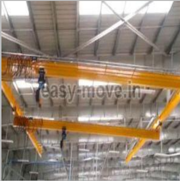
Under Slung Crane