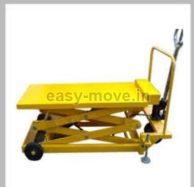
Die Loader Scissor Lift