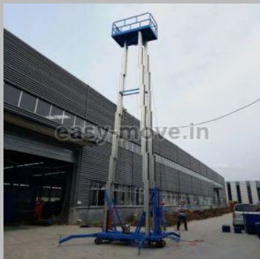
Construction Work Platform