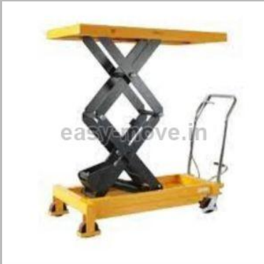
Portable Lift Table