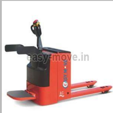
Electrical Pallet Truck