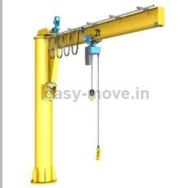
Single Girder Jib Crane