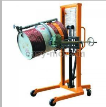
Hydraulic Drum Stacker