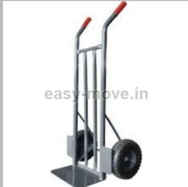
Stainless Steel Hand Trolley