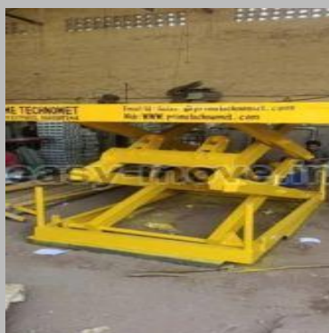
Hydro Lift Table