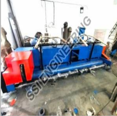
Semi-Automatic Cement Road Paver Machine