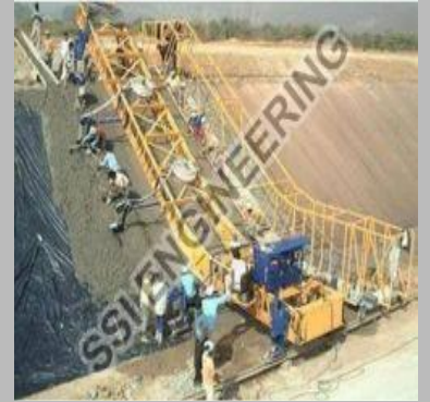
Semi-Automatic Concrete Canal Lining Paver Machine