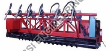
2.5 Ton Road Paver Finisher Machine