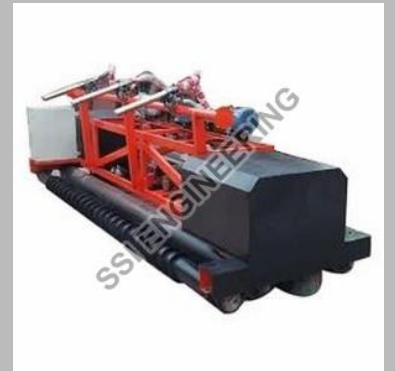
Red Concrete Road Paver Machine