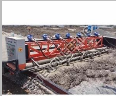
Concrete Roller Screed Paver Machine