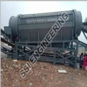
Automatic 300 TDP Trommel Screen Machine