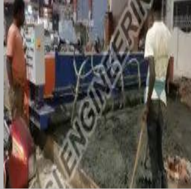
semi automatic concrete road paver machine