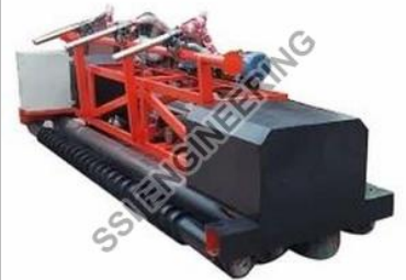
Red Concrete Road Paver Machine