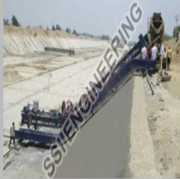
Semi Automatic Canal Paver Machine