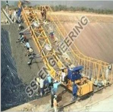
SSI Engineering Canal Paver Machine