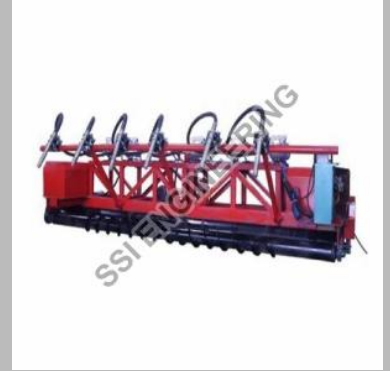
2.5 Ton Road Paver Finisher Machine