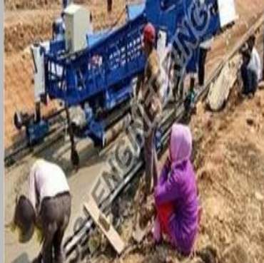
Semi-Automatic Canal Construction Machine