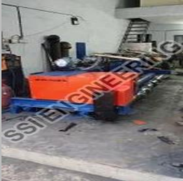
Semi-Automatic Road Construction Machine