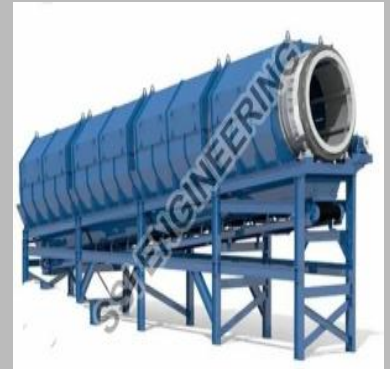
Electronic Trommel Screen Machine