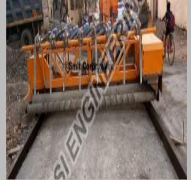
Fixed Form Concrete Road Paver Machine