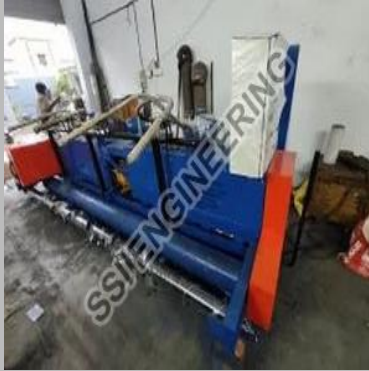
Automatic Road Making Machine