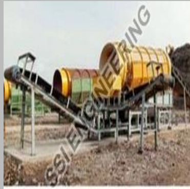
Industrial Trommel Screen Machine