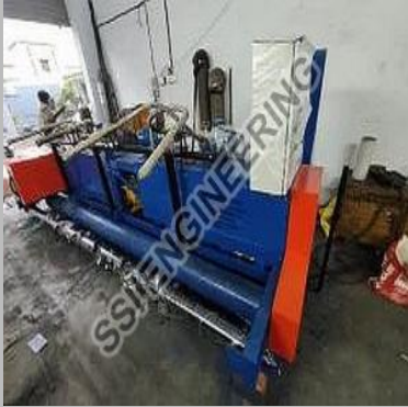
Semi-Automatic Road Paver Finisher Machine