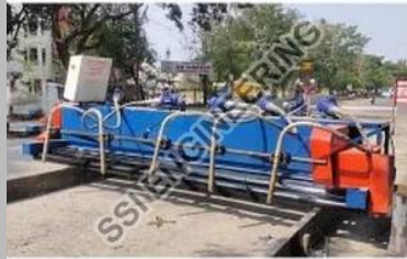
Automatic Road Concrete Paver Machine