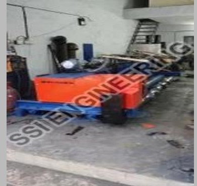
Rcc Road Construction Machine