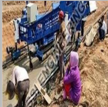
Semi-Automatic Canal Making Machine