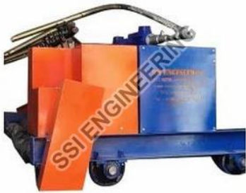
Fixed Foam Concrete Road Paver Machine