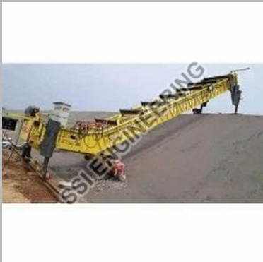
Semi-Automatic Canal Paving Machine