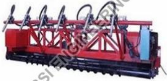
Automatic Concrete Road Paver Machine