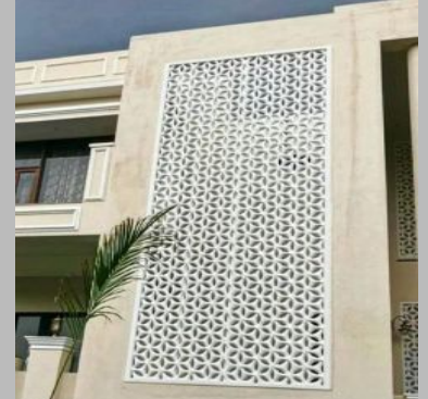
Rectangular GRC Jali