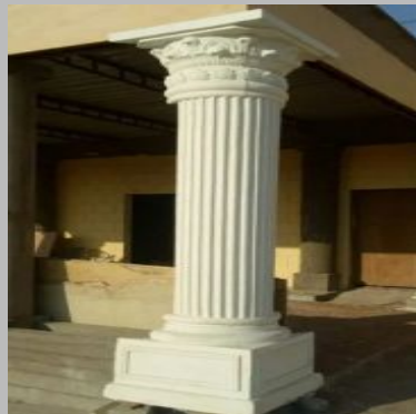
White GRC Column