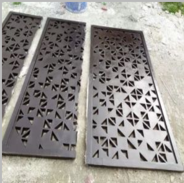
25 mm GRC Jali