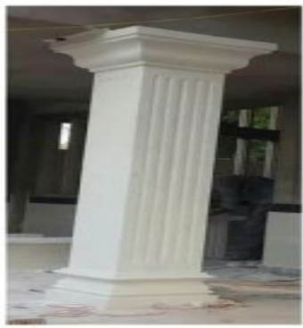
35mm White GRC Column