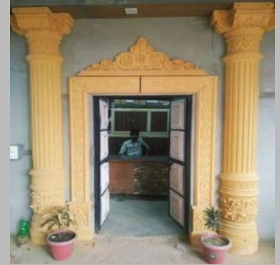
Golden GRC Column