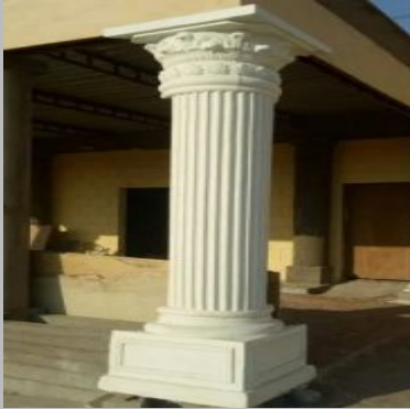
White GRC Column