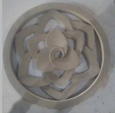
Round GRC Jali