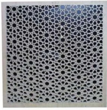
Square GRC Jali