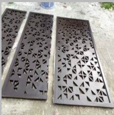
25 mm GRC Jali