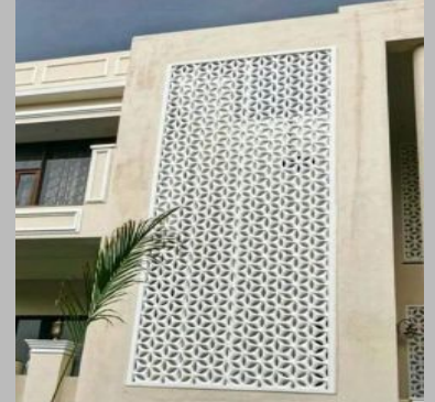
Rectangular GRC Jali