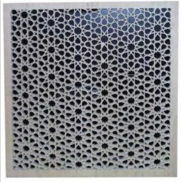
Square GRC Jali

We SP GRC And Handicrafts are a leading and distinguished Manufacturer and Supplier of quality Building Columns & Pillars, Ceiling Cornice, Decorative Pot, FRP Domes and GFRG Jali.