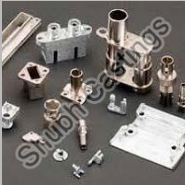
zinc die castings

We Shubh Castings are a leading and distinguished Manufacturer, Exporter, Supplier, Retailer, Service Provider and Retailer of quality Cnc Job Work, Cnc Machined Components, Industrial Casting, Industrial Casting & Casting Parts and Jigs, Casting Dies, Die Casting Moulds & Moulding Tools.