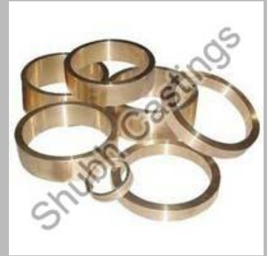
Non Ferrous Castings