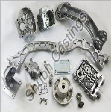
Aluminium Casting Services