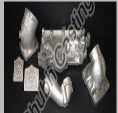
aluminium die casting parts