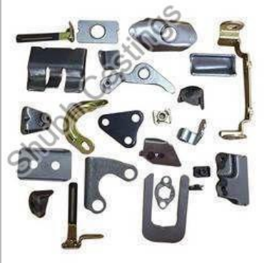
Press Parts Manufacturing Services