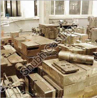
Zinc Die Casting Services