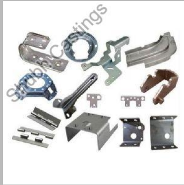
Sheet Metal Parts Manufacturing Service