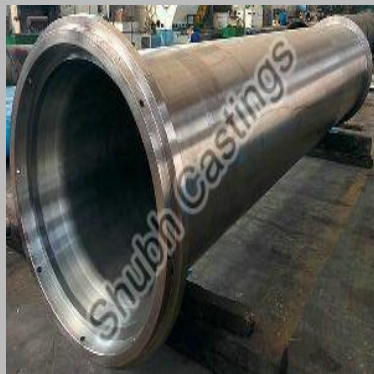
Centrifugal Casting Pipe