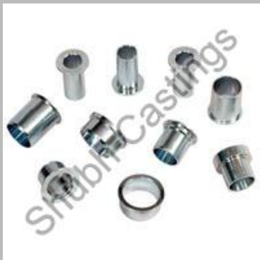
CNC Turned Components