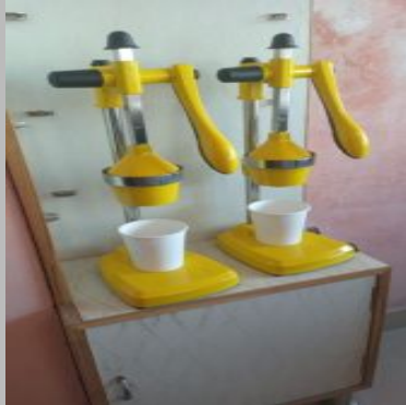
Manual Juicer Machine