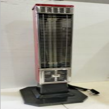
Electric Room Heater

We Shri Ram Industries are a leading and distinguished Manufacturer, Supplier, Trader, Exporter and Importer of quality AIR Coolers, Alloy Wire, Blender, Copper Wire and Domestic Fans, AC & Coolers.