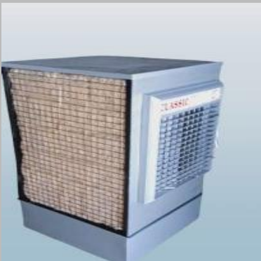
Mild Steel Air Cooler