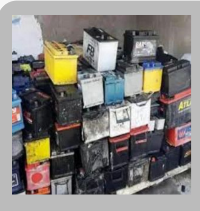
Hard Plastic Battery Box Scrap