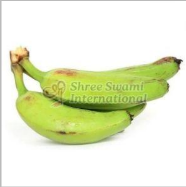
Raw Green Banana