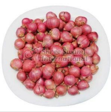
Small Red Onion