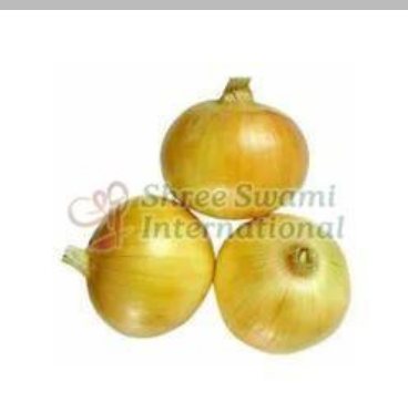
fresh yellow onion