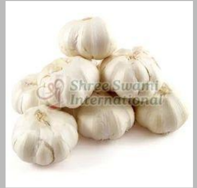
A Grade White Fresh Garlic