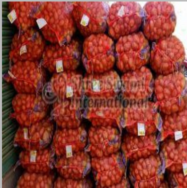
fresh red onion