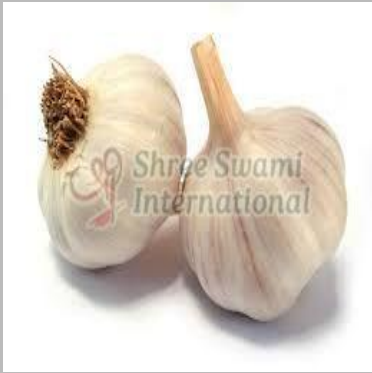
Organic Fresh Garlic