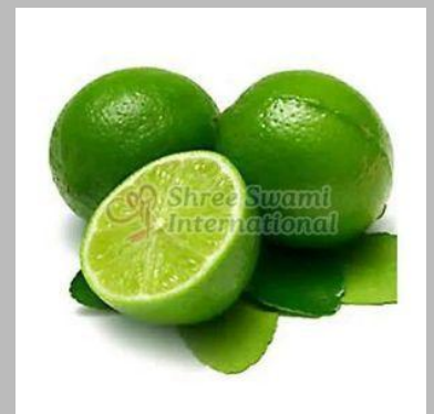
Fresh Green Lemon