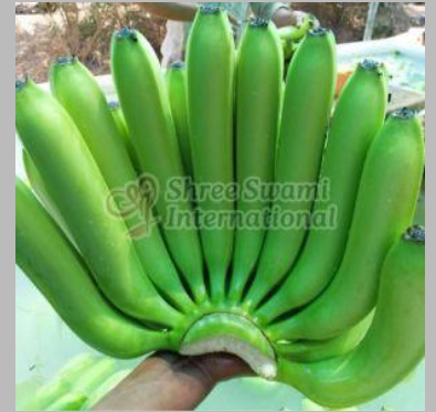
Cavendish Green Banana