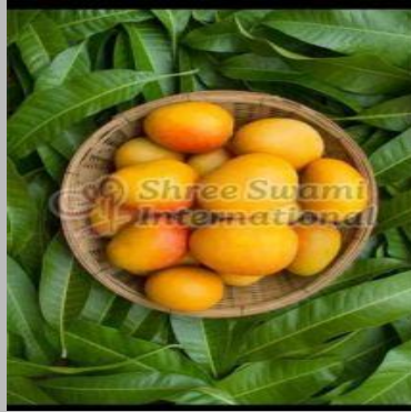
Natural Fresh Mango