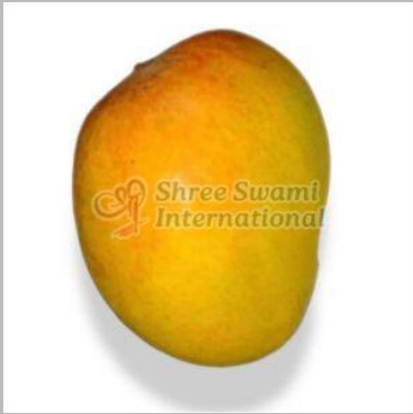
Organic Totapuri Mango