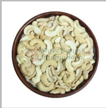
Split Cashew Nuts