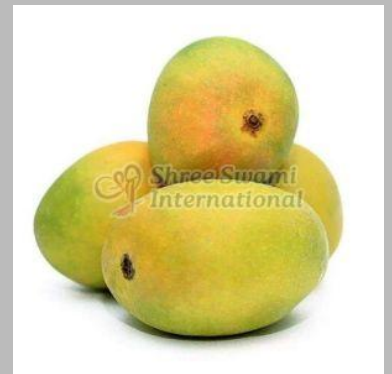
A Grade Fresh Mango