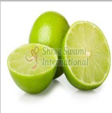
Organic Fresh Lemon