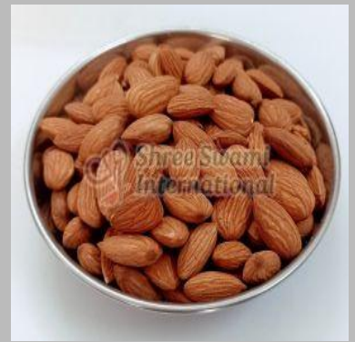
Organic Almond Nuts