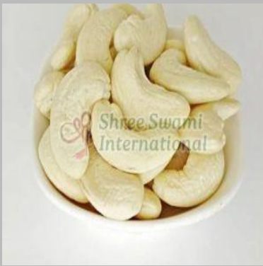
Whole Cashew Nuts