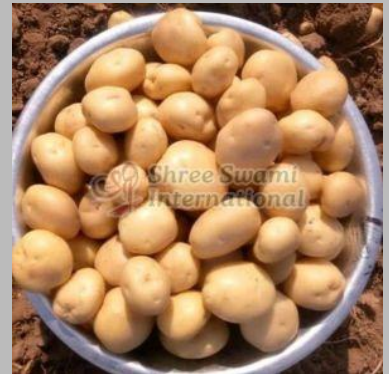
Brown A Grade Fresh Potato