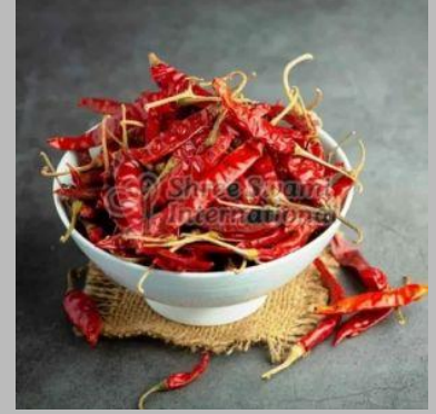
Guntur Dry Red Chilli