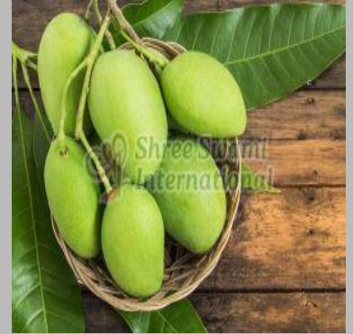
Green Organic Raw Mango