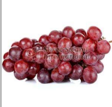
Fresh Red Seedless Grapes