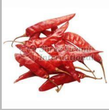
Stemless Dry Red Chilli