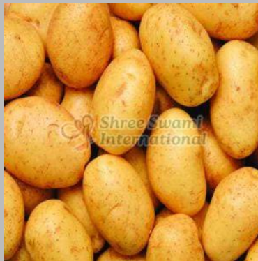
Natural Fresh Potato