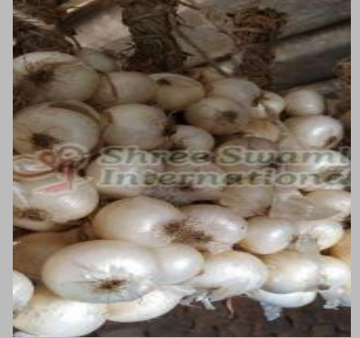
Natural White Onion