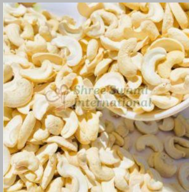
Broken Cashew Nuts