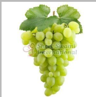
A Grade Fresh Green Grapes