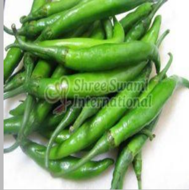
Organic Green Chilli