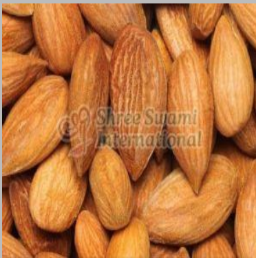
Natural Almond Nuts