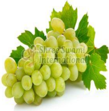
Organic Green Grapes