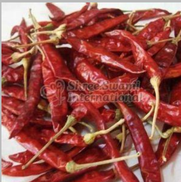
A Grade Whole Red Chilli