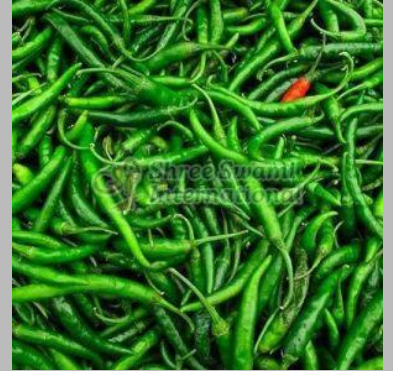
Indian Green Chilli