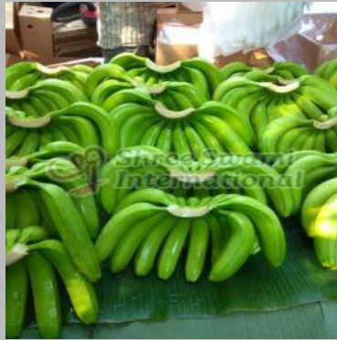
Fresh Green G9 Banana