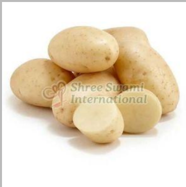
Fresh Organic Potato