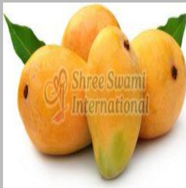
fresh alphonso mango