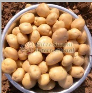
Brown A Grade Fresh Potato