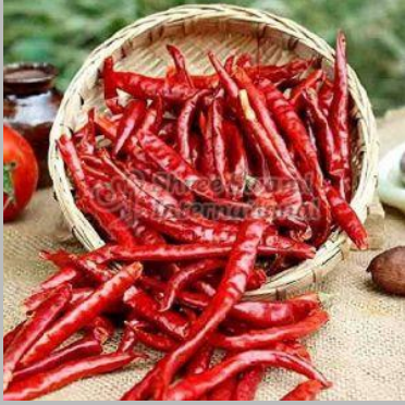
Teja S17 Dry Whole Red Chilli (Steamless)