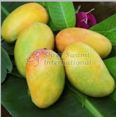
Fresh Kesar Mango