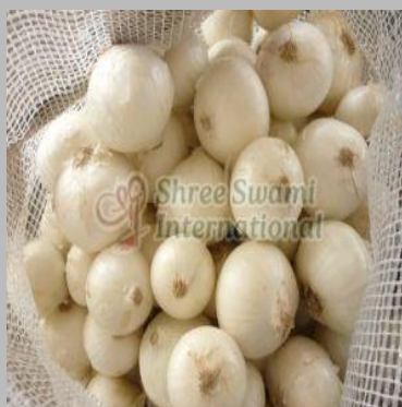
Fresh White Onion