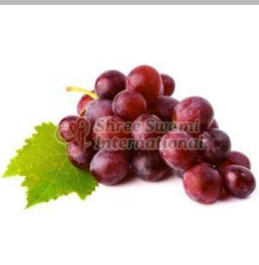
A Grade Fresh Red Grapes