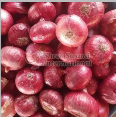
India Fresh Red Onion