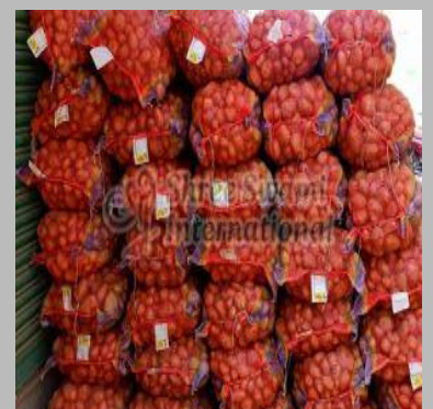
fresh red onion