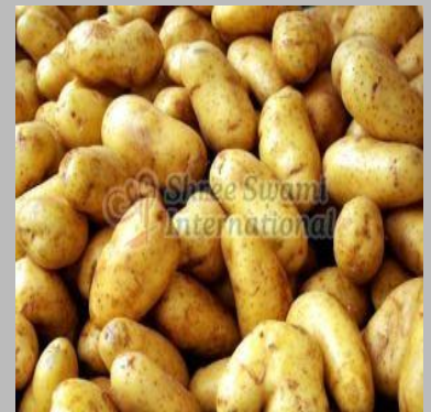
Indian Fresh Potato