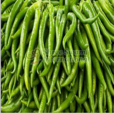
Spicy Green Chilli