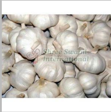
Natural Fresh Garlic