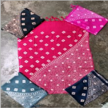
Tie Dye Rayon Stoles