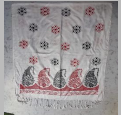
3D Printed Rayon Stoles