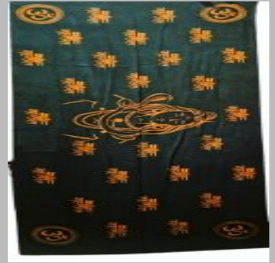
Mahakal Print Rayon Stoles