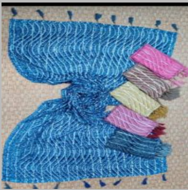
Lurex Rayon Stoles