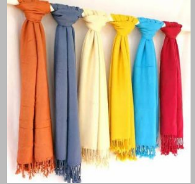
Plain Viscose Stoles