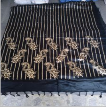
Black Viscose Stoles