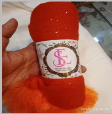
Latkan Viscose Stoles