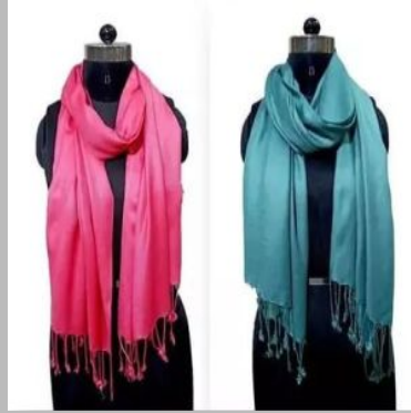
Pashmina Viscose Stoles