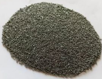
Zinc Cut Wire Shot