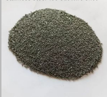
Stainless Steel 430 Cut Wire Shot