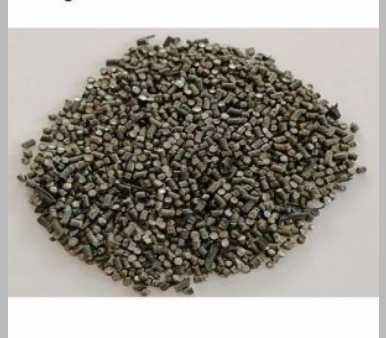
High Carbon Steel Cut Wire Shot