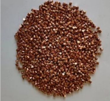
Brass Cut Wire Shot