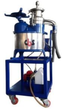
CBS Technologies Tramp Oil Terminator