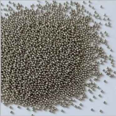
Stainless Steel 410 Cut Wire Shot