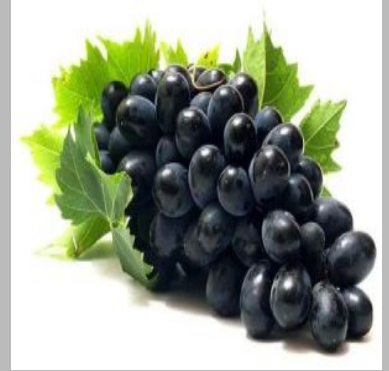
Fresh Black Grapes