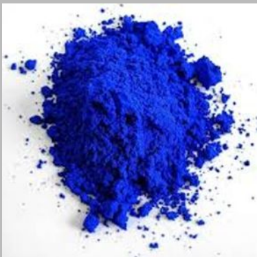
Phthalocyanine Pigment Blue 15:4