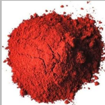
Fast Red Pigment