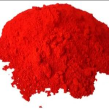
Lake Red MC Pigment