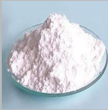
Magnesium Silicate Powder