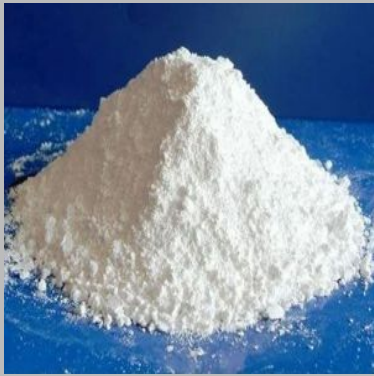
Barium Sulphate Powder

We Shailaja Corporation are a leading and distinguished Exporter, Supplier and Importer of quality Ammonium Compounds, Animal Feed, Bentonite, Breakfast Cereals and Calcium Carbonate Powder.