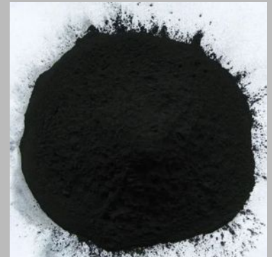
Carbon Black Pigment