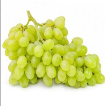
Fresh Green Grapes