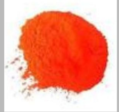
Orange 34 Pigment