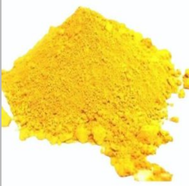
Yellow 83 Pigment