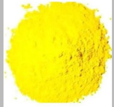
Lemon Chrome Pigment