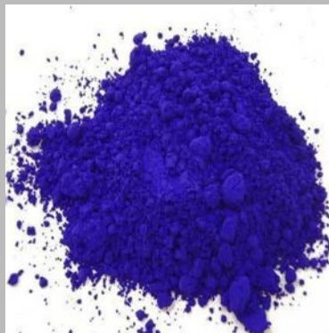
Phthalocyanine Pigment Blue 15:3