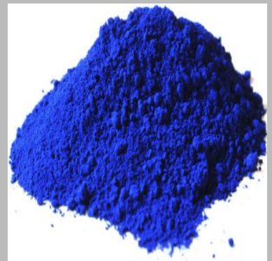
Phthalocyanine Pigment Blue 15:1