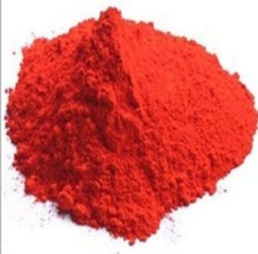
Scarlet Chrome Pigment