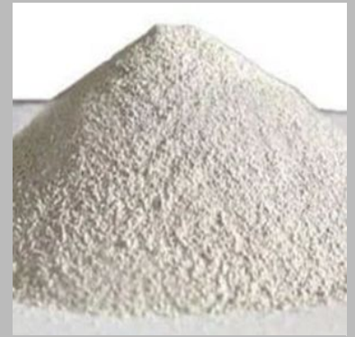
Aluminium Silicate Powder