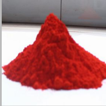
Red M2KB Pigment