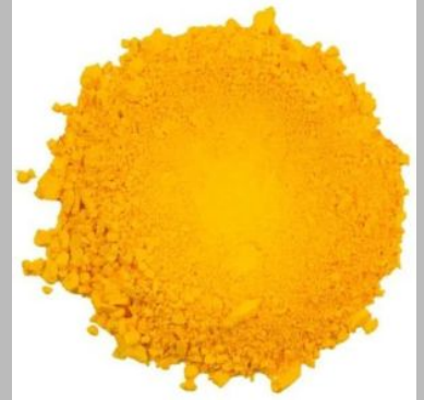
Yellow 13 Pigment