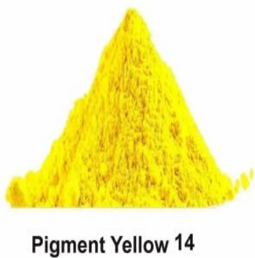
Pigment Yellow 14