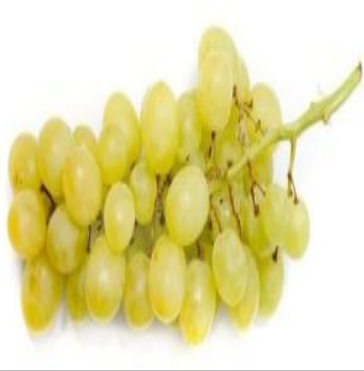
Fresh Yellow Grapes