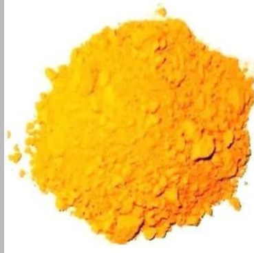
Middle Chrome Pigment