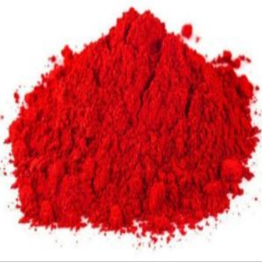
Rubine Toner Pigment