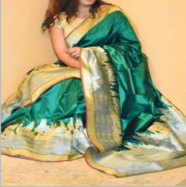
G1-651 Banarasi Saree

Sangharsh Textile Weaver Producer Company Limited is known as top Manufacturer, Exporter and Supplier of best Banarasi Lehenga, Banarasi Sarees, Dress Materials, Dupatta and Fabric.