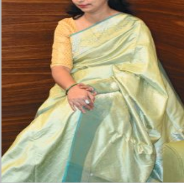
T1-661 Banarasi Saree