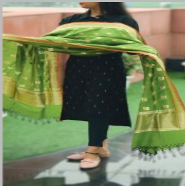
Green Banarasi Dupatta