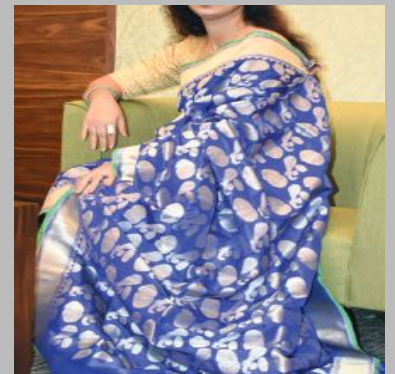
PT-506 Banarasi Saree