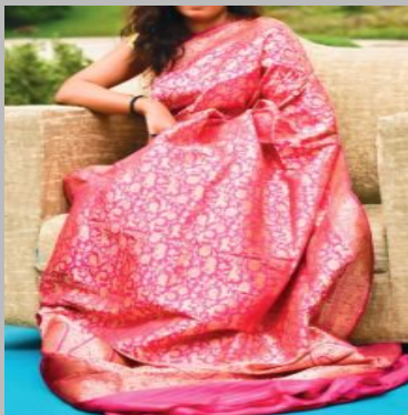
S1-511 Banarasi Saree