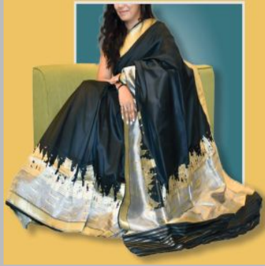
G1-652 Banarasi Saree