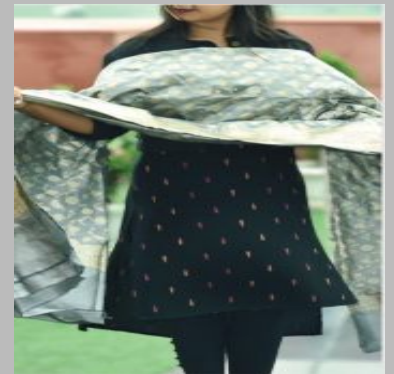
Grey Banarasi Dupatta