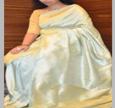
S2-521 Banarasi Saree