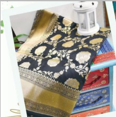
J1-542 Banarasi Saree