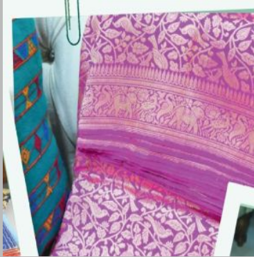
S4-526 Banarasi Saree