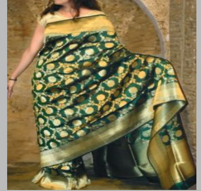
J1-541 Banarasi Saree