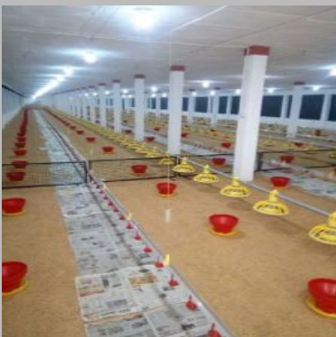
Auto Feeding System