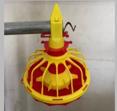
Poultry Pan Feeder