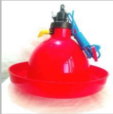
Poultry Bell Drinker