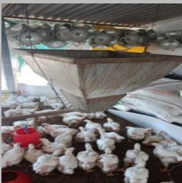
Poultry Chick Feeder