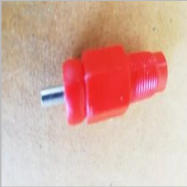
Poultry Layer Nipple