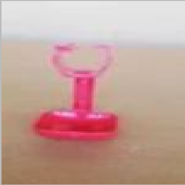
Poultry Drip Cup