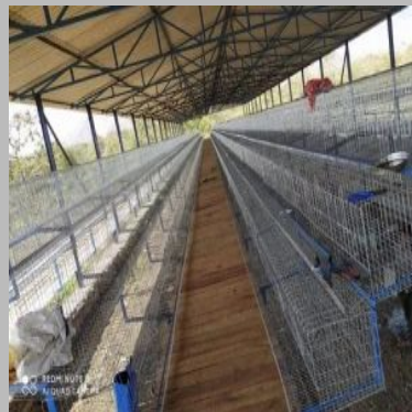
Poultry A Type California Chicken Cage