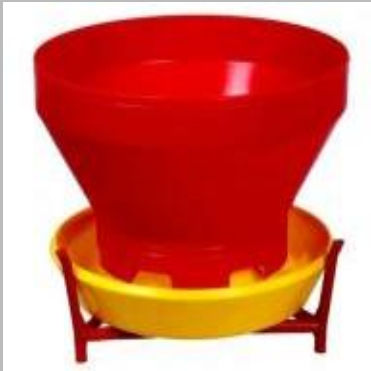
Turbo Chick Feeder