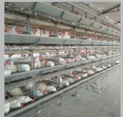
Poultry Trolley System