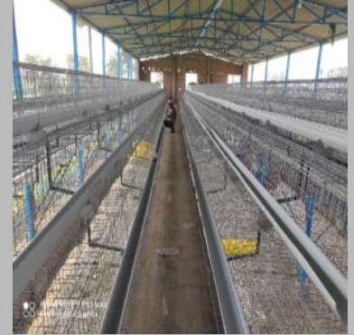
Poultry Layer Cages