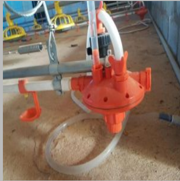
Poultry Drinking System