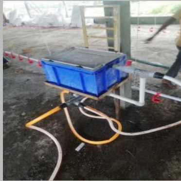
Poultry Nipple Drinker System