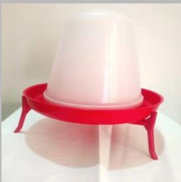
4.5L Poultry Chick Drinker