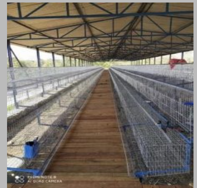
Broiler Poultry Equipment