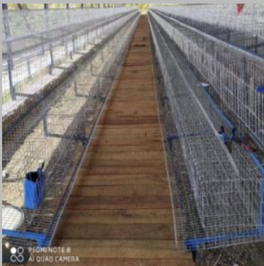
Poultry Layer Cage