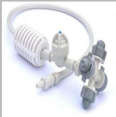
Four Way Plastic Fogger