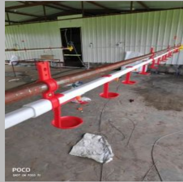
Broiler Nipple Drinking System