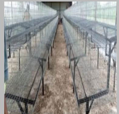
Layer Poultry Cages