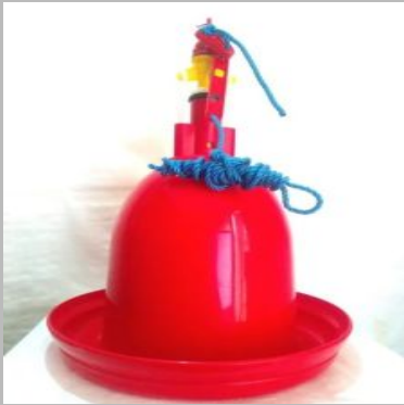
Poultry Jumbo Drinker