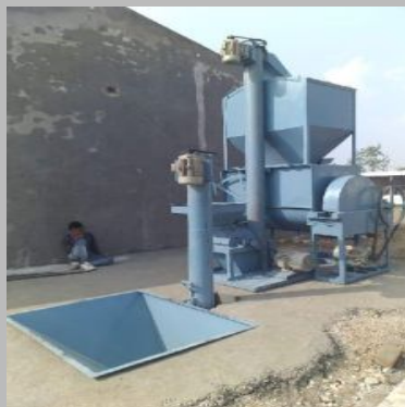
Poultry Feed Mills