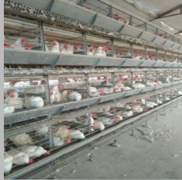
Poultry Trolley System