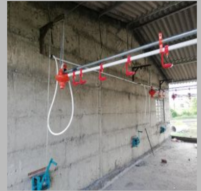
Broiler Drinking System