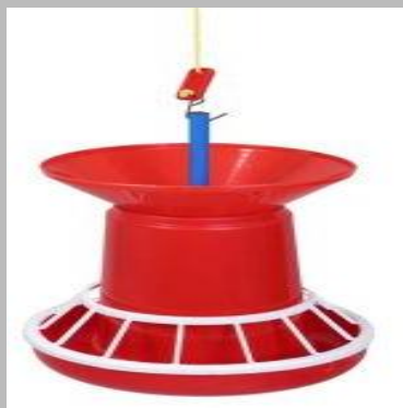
Jumbo Poultry Feeder