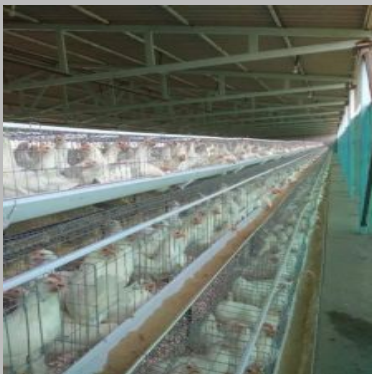
Layer Battery Cages Poultry Equipment