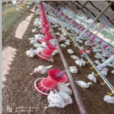
PVC Poultry Feeder