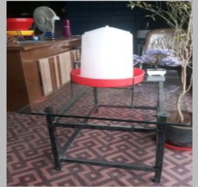
8L Poultry Grower Round Drinker