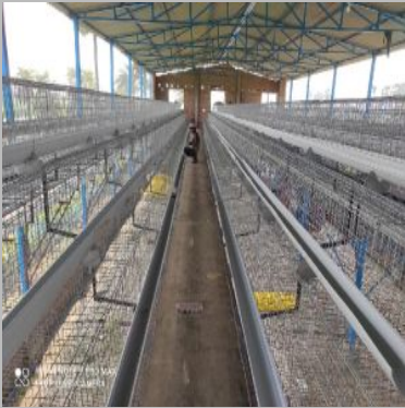
Poultry Layer Cages

We SAINATH AGRO are a leading and distinguished Manufacturer, Exporter, Supplier, Retailer, Trader, Distributor and Importer of quality Animal Feed Making Machine, Broiler Drinker, Dispensers & Vending Machines, Egg Tray and Feed Supplements.