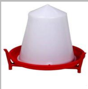
3L Chick Drinker