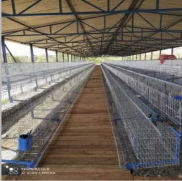
Steel Poultry Cages