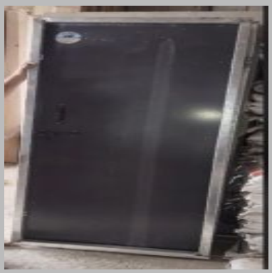
PVC Bathroom Door