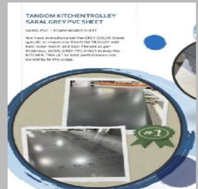
Gray Kitchen Tandom Grey Pvc Sheet