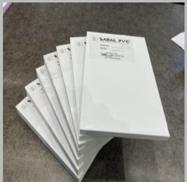
PVC Foam Sheet