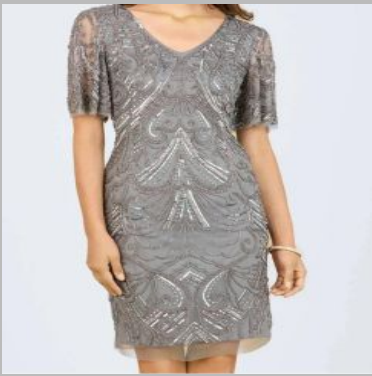
Ladies Fancy Short Dress