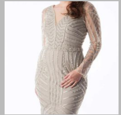
Ladies Grey Fish Cut Dress