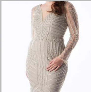
Ladies Grey Fish Cut Dress