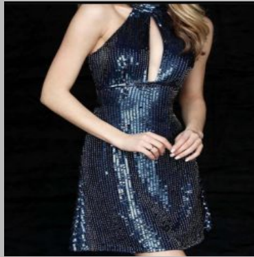
Ladies Party Wear Short Dress