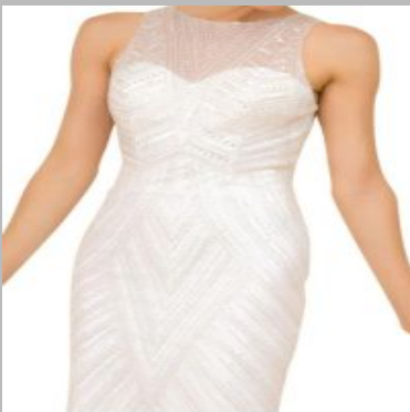
Ladies Long Evening Dress