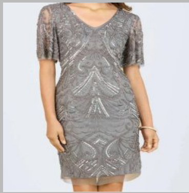
Ladies Fancy Short Dress