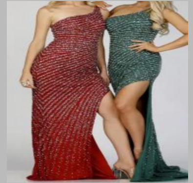
Ladies Party Wear Evening Dress