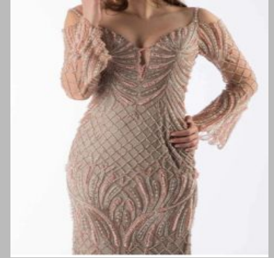
Ladies Party Wear Long Dress