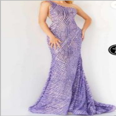
Ladies Purple Casual One Piece Dress