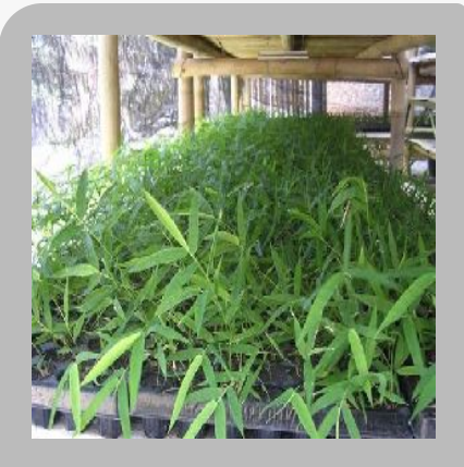
tissue culture bamboo plants