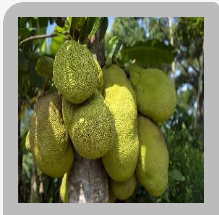
Hybrid Jackfruit plant