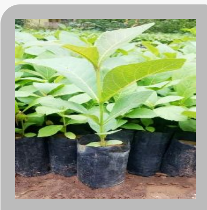
Tissue Culture Teak Plant