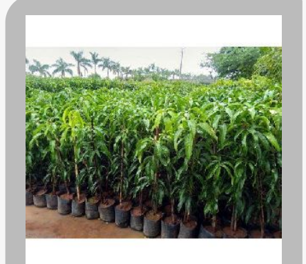
kesar mango plant