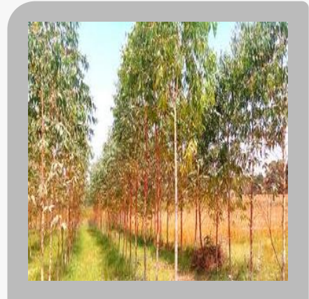
african mahogany plants