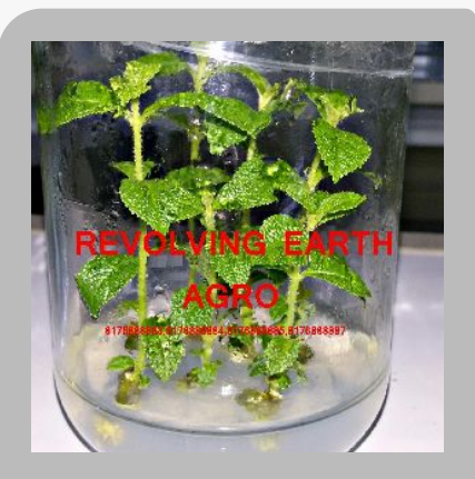
Tissue Culture Teak Plants