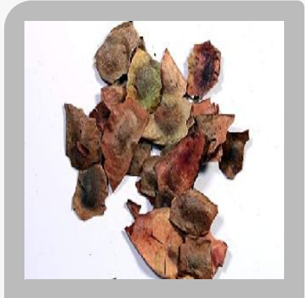
Sheesham (Rosewood) Seeds