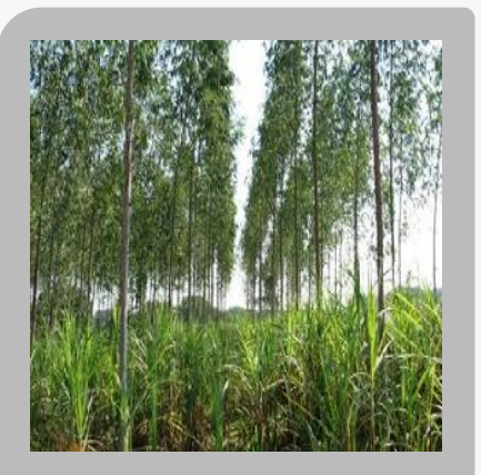
Eucalyptus Clone Plants