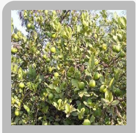
Tissue Culture Lemon Plants