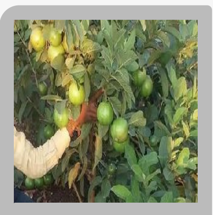
Tissue Culture Guava Plants