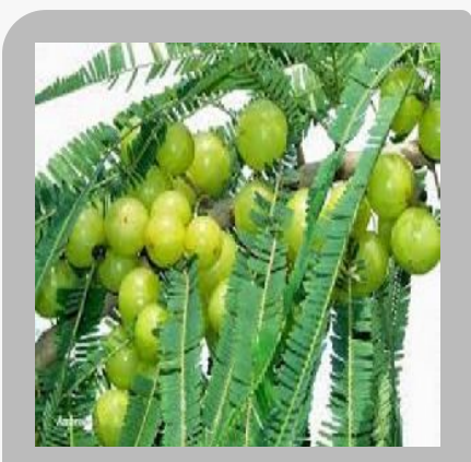
Tissue Culture Amla Plants