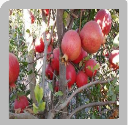
Tissue Culture Pomegranate Plants