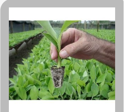
Tissue Culture Banana Plants