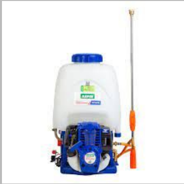
Aspee Power Sprayer