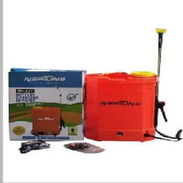
Neptune Double Motor Battery Sprayer