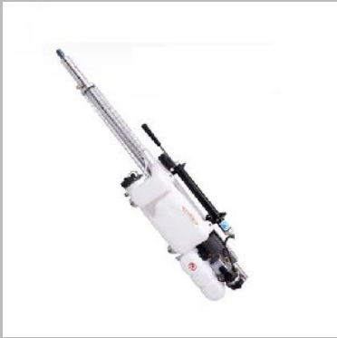
SS Tank Fogging Machine