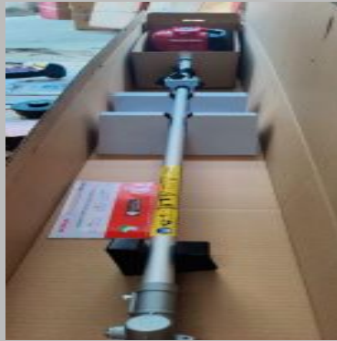
honda brush cutters