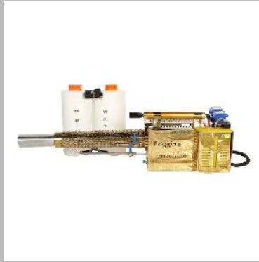
RAPL-R120 Fogging Machine