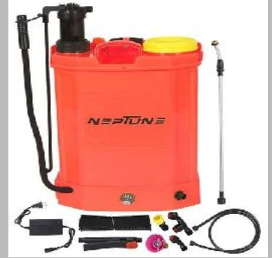
Neptune Battery Sprayer