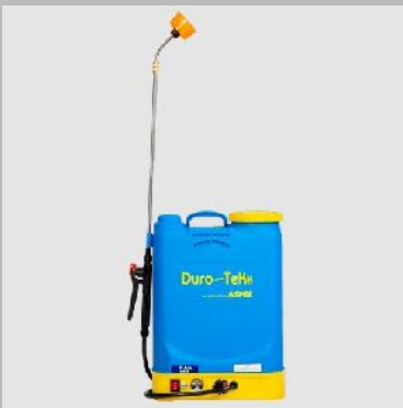
Aspee Durotekk Battery Sprayer