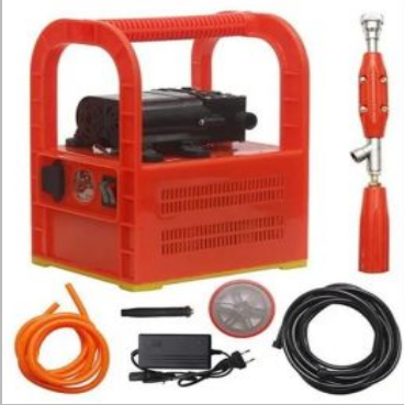
Neptune Portable Battery Sprayer