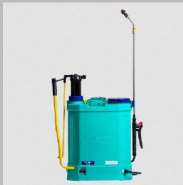
Aspee Duo Electro 2 In 1 Battery Sprayer