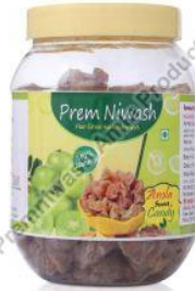
Amla Sweet Candy