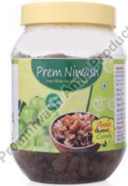
Amla Chatpata Candy