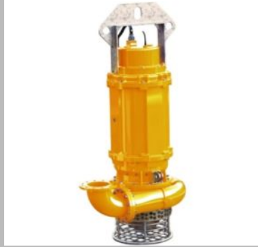
SPSL506S-6P 50 HP Submersible Slurry Pump