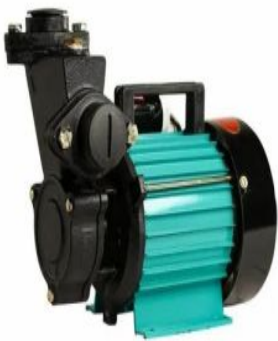
Self Priming Monoblock Pumps