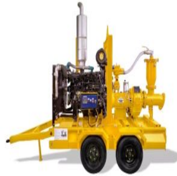
8 Inch Diesel Driven Pump