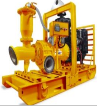
Flood Control pump