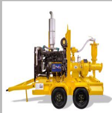
Diesel Driven Pumps Auto Prime Pumps