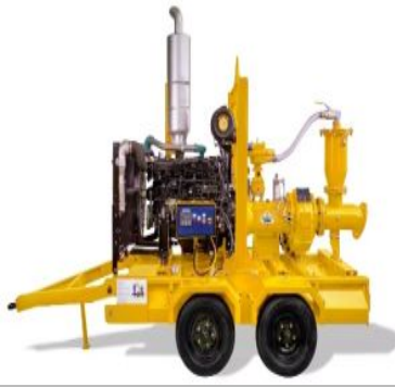
20 Inch Diesel Driven Pump