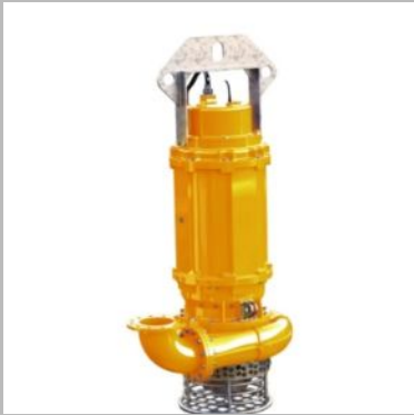
SPSL758S-6P 75 HP Submersible Slurry Pump