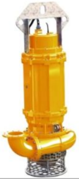
SPSL506SH-6P 50 HP Submersible Slurry Pump