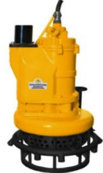
SPLSL53S 5 HP Submersible Slurry Pump