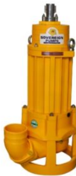
6 HP SPNC63M Submersible Non Clog Pump