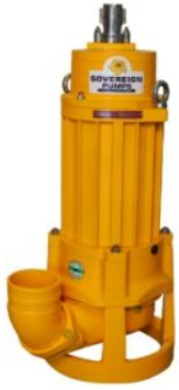
SPNC83M 8 HP Submersible Non Clog Pump