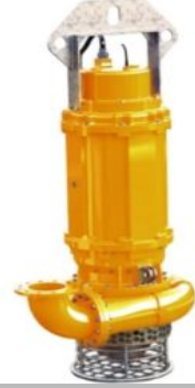
SPSL508S-6P 50 HP Submersible Slurry Pump