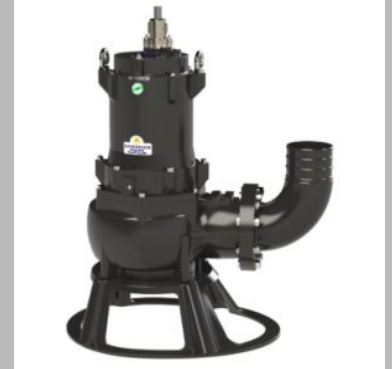
SPS208S/P 20 HP Submersible Sewage Pump