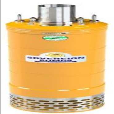
submersible dewatering pumps SPG103M