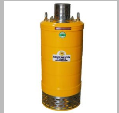
SPG73M 7.5 HP Submersible Dewatering Pump