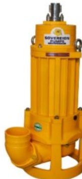
SPNC103M 10 HP Submersible Non Clog Pump