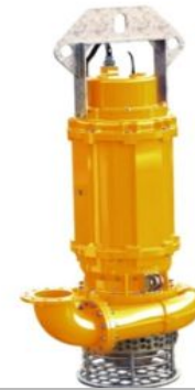
SPSL306S-6P 30 HP Submersible Slurry Pump