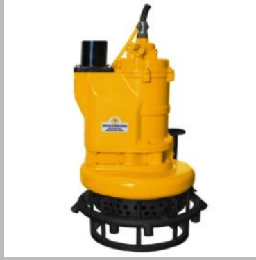
SPSL74S 7.5 HP Submersible Slurry Pump