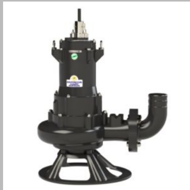
SPS107SH/PH 10 HP Submersible Sewage Pump