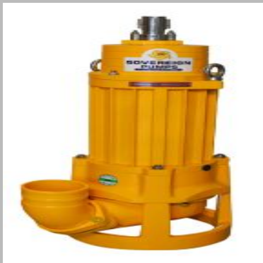
Non Clog Pumps