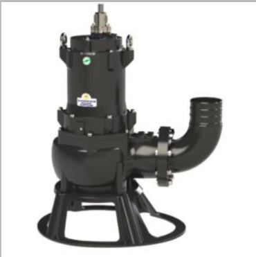
SPS158S/P 15 HP Submersible Sewage Pump