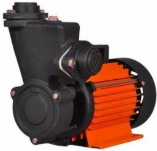
Monoblock Water Pumps