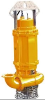
SPSL756S-6P 75 HP Submersible Slurry Pump