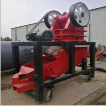
Mild steel stone crusher

We Panchkula Engineering Works are a leading and distinguished Manufacturer, Exporter, Supplier, Trader, Distributor and Service Provider of quality Construction Machinery & Equipment, Crushing Machines, Filters & Filtration Systems, Grinding & Milling Tools & Machinery and Idler.