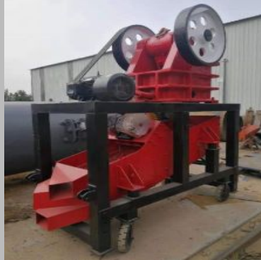
Mild steel stone crusher