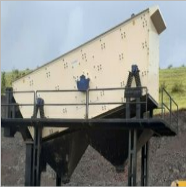
Industrial Vibrating Screen