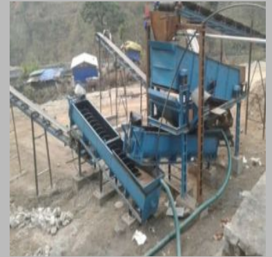
Sand Washing Plant