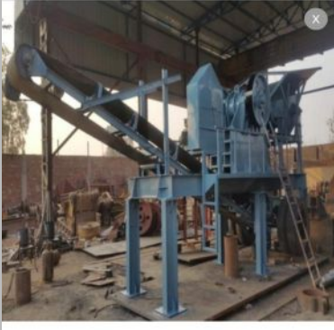
Mobile Crusher Plant