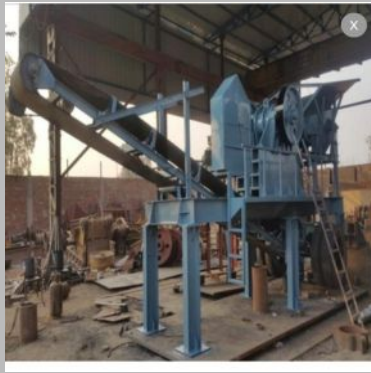
Mobile Crusher Plant