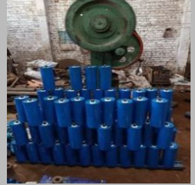
Conveyor Idler Roller