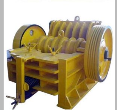
heavy duty stone crusher