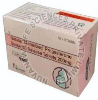
200mg Natural Micronized Progesterone Sustained Release Tablets