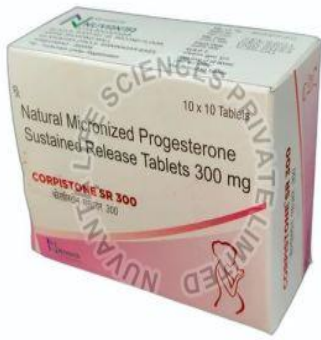
300mg Natural Micronized Progesterone Sustained Release Tablets