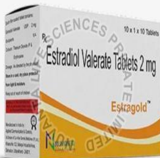
Estradiol Valerate Tablets