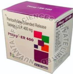
Pentoxifylline Extended Release Tablets