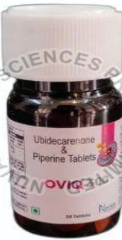
Ubidecarenone and Piperine Tablets