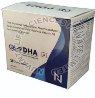
Q6- 9 DHA Softgel Capsules