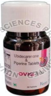
Ubidecarenone and Piperine Tablets