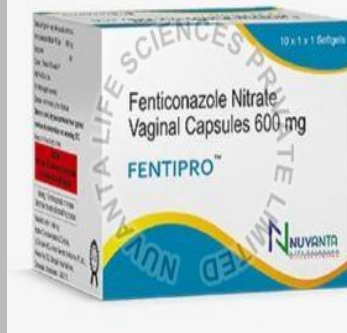
Fenticonazole Nitrate Vaginal Capsules