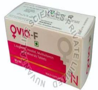
L-Arginine, Inositol and Multivitamin With Minerals Tablets