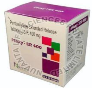
Pentoxifylline Extended Release Tablets