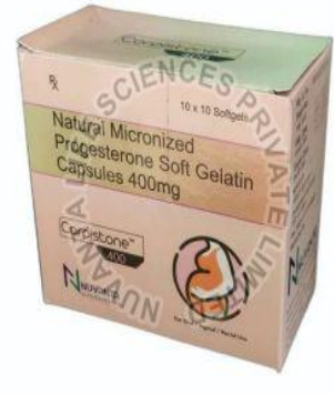
400mg Natural Micronized Progesterone Soft Gelatin Capsules