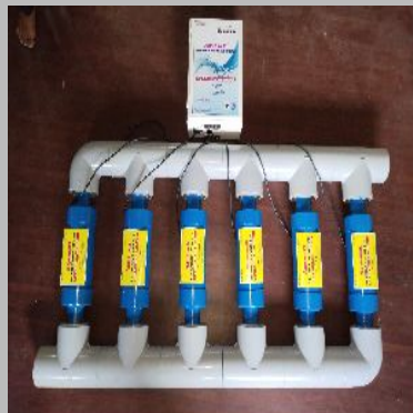
Electronic Water Conditioner Multi 6 Chambers Agricultural