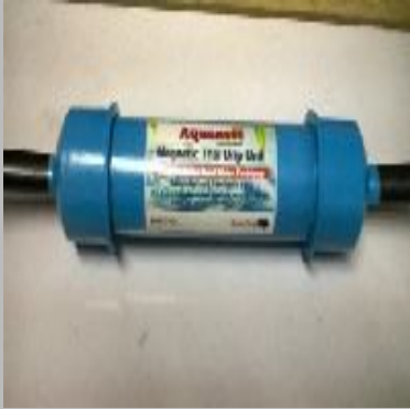
Magnetic Water Trial Drip Unit