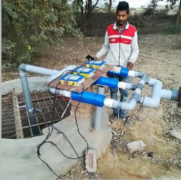
Electronic Water Conditioner Multi Flow