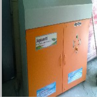
Industrial Electronic Water Conditioner