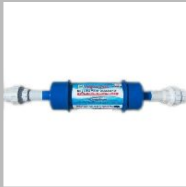
Electronic Magnetic Water Conditioner