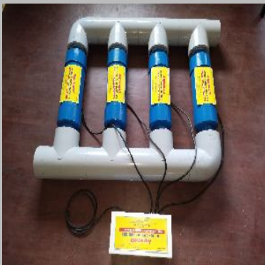
multi flow 4 inch agricultural electronic water conditioner