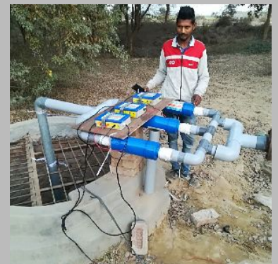
Electronic Water Conditioner Multi Flow