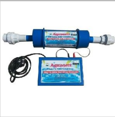
FX Model Electronic Water Conditioner

NISHA ENTERPRISES is known as top Manufacturer, Exporter, Supplier, Retailer and Trader of best Cabinet Fittings, Electronic Water Conditioner, Fuel Sever, hydroponic Fodder Systems and Magnetic Water Conditioner.