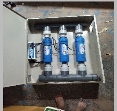
Electronic Water Conditioner Multi 3 chambers With Cabinet Fitting