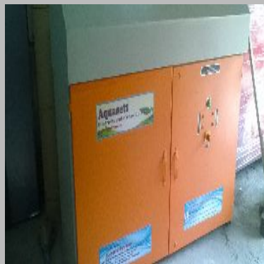
Industrial Electronic Water Conditioner