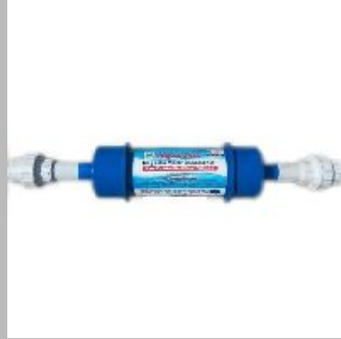
Electronic Magnetic Water Conditioner