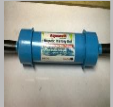
Magnetic Water Trial Drip Unit