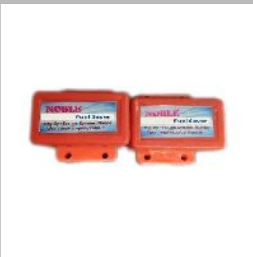
Noble Fuel Saver