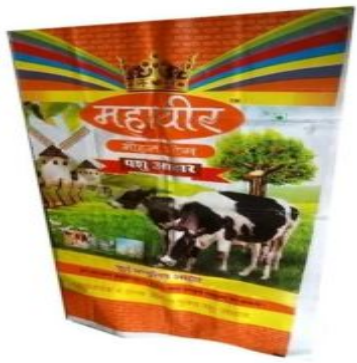
BOPP Cattle Feed Bags