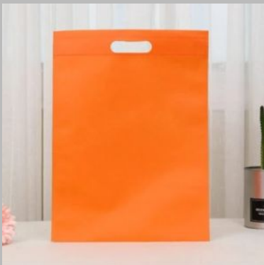
Plain D Cut Non Woven Bags