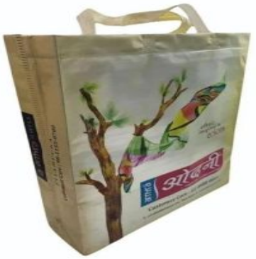
Shopping Loop Handle Non Woven Bags