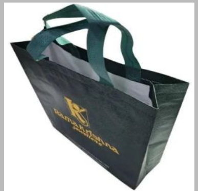
Laminated Loop Handle Non Woven Bags