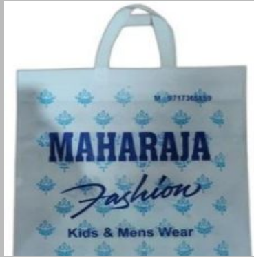
Printed Loop Handle Non Woven Bags