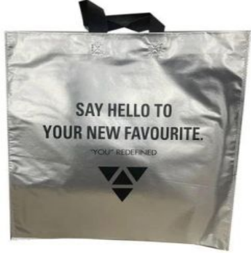
Recyclable Loop Handle Non Woven Bags