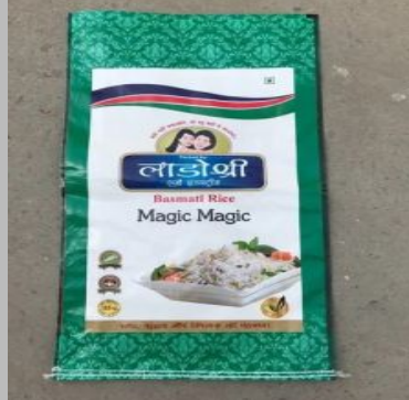
BOPP Laminated Bags