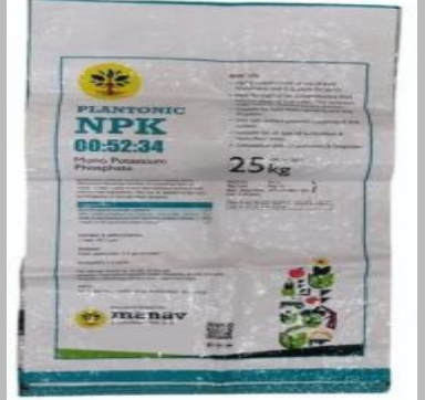
BOPP Chemical Bags