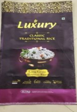
BOPP Rice Bags