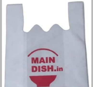
Printed W Cut Non Woven Bags