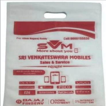
Printed D Cut Non Woven Bags