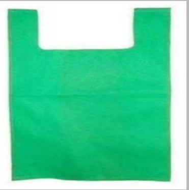
Plain U Cut Non Woven Bags