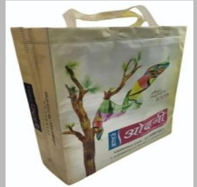
Shopping Loop Handle Non Woven Bags