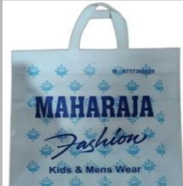
Printed Loop Handle Non Woven Bags