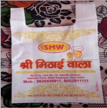
Printed U Cut Non Woven Bags