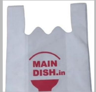
Printed W Cut Non Woven Bags