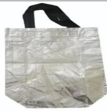
Plain Loop Handle Non Woven Bags