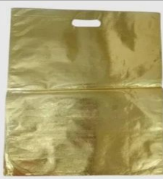
Laminated D Cut Non Woven Bags