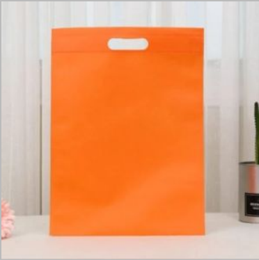
Plain D Cut Non Woven Bags

We MS Enterprises are a leading and distinguished Manufacturer, Exporter, Supplier, Retailer, Trader, Distributor, Importer and Service Provider of quality Agricultural Bags, Bags, Pouches, Card Holder & Cases, BOPP Bag, Consumable Seeds and Flours.