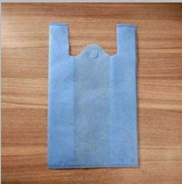
Plain W Cut Non Woven Bags