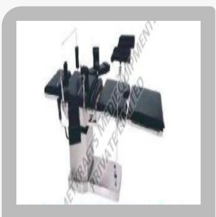
C-Arm Compatible Fully Electric Operating Table