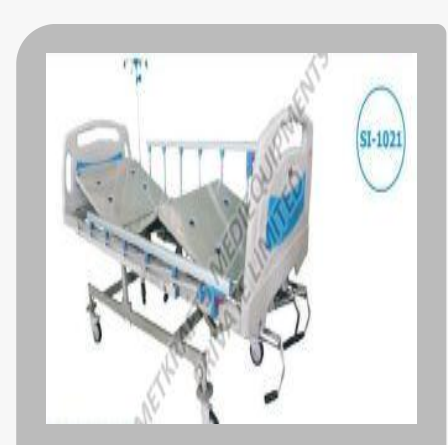
SI-1021 Three Function ICU Manual Bed