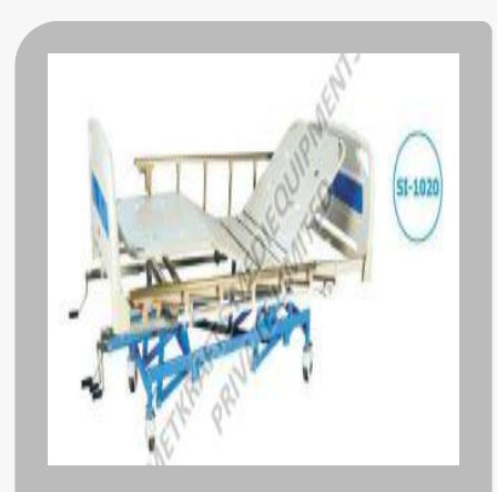
SI-1020 Three Function ICU Manual Bed