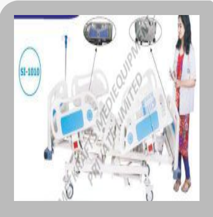
SI-1010 Five Function Electric ICU Bed

We Metkrafts Mediequipments Private Limited are a leading and distinguished Manufacturer, Exporter, Supplier and Retailer of quality Autoclaves, Bed Linen, Cabinets & Enclosures, Canvas and Conveyors.