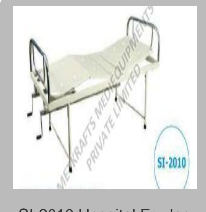
SI-2010 Hospital Fowler Bed