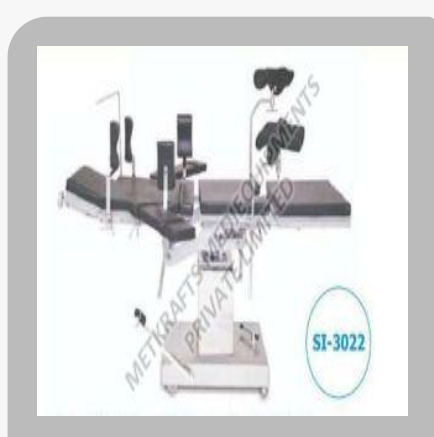
C-Arm Compatible Delux Hydraulic Operating Table