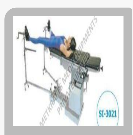
C Arm Compatible Hydraulic Operating Table