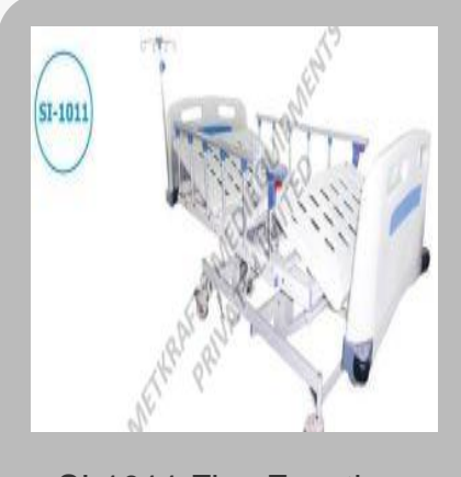
SI-1011 Five Function Electric ICU Bed