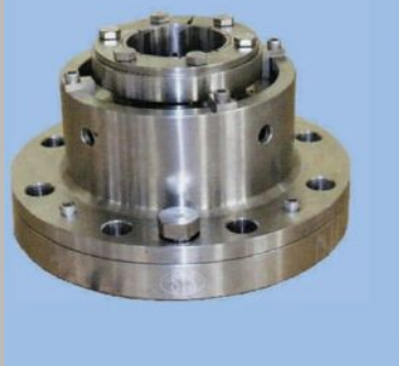
Stainless Steel Single Reactor Seal