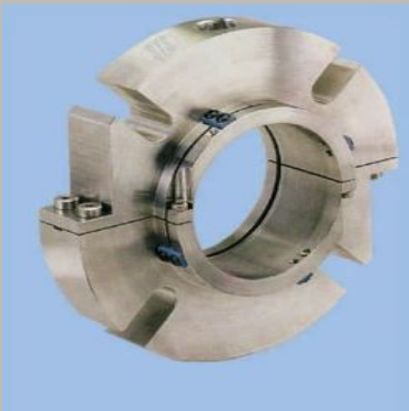
Stainless Steel Split Seal