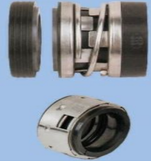
Heavy Duty Bellow Seal