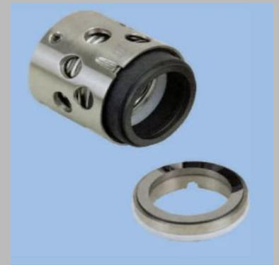
Single Acting Balanced Seal