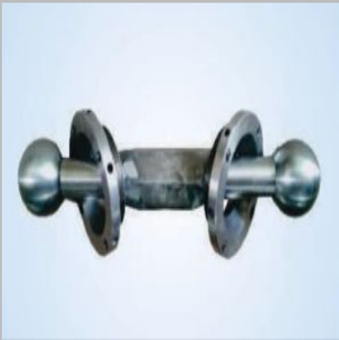
Stainless Steel Mechanical Seal

We Meghraj Enterprises are a leading and distinguished Manufacturer and Supplier of quality Barrel Pumps, Bellow Seal, Casting Dies, Diaphragm Pump and Industrial Seals.