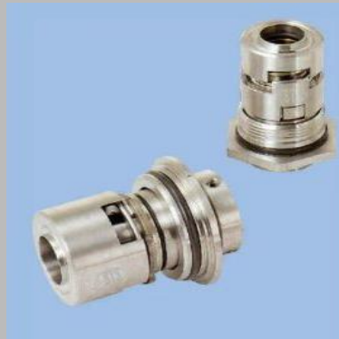
STS Cartridge Seal