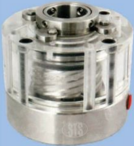
Stainless Steel Slurry Seal