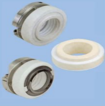
Teflon Bellow Unbalance Seal