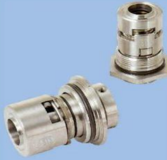
STS Cartridge Seal