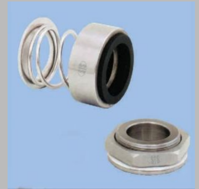
Stainless Steel Dairy Seal