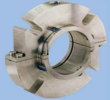
Stainless Steel Split Seal