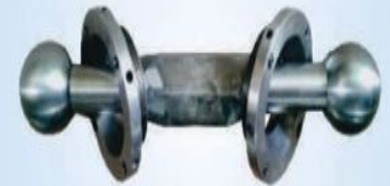
Stainless Steel Mechanical Seal