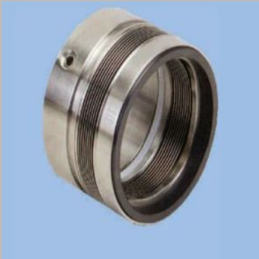
Balanced Metal Bellow Seal