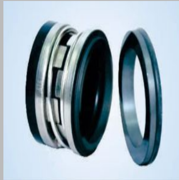
Rubber Bellow Seal