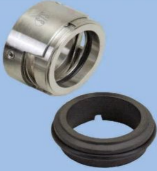
Wave Spring Unbalanced Seal