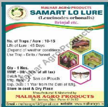
Smart LO Lure