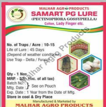
Smart P.G. Lure