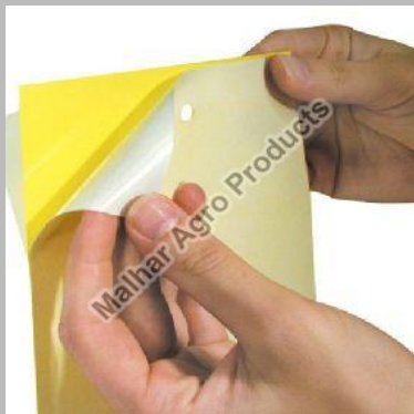
PVC Sticky Trap