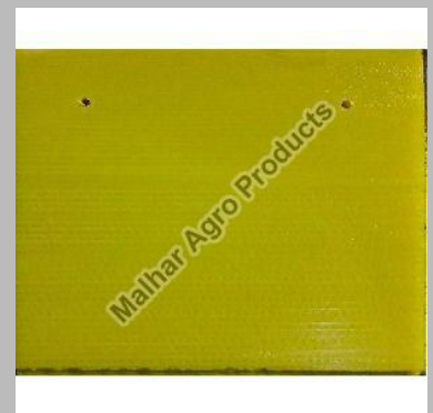
Pest Glue Trap