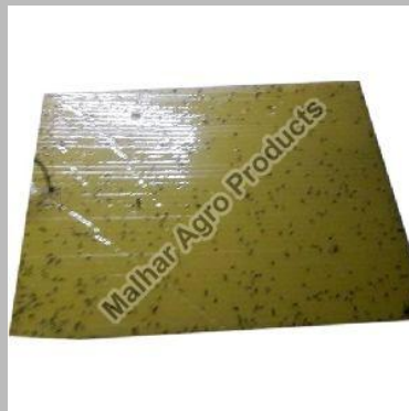
Bio Sticky Trap