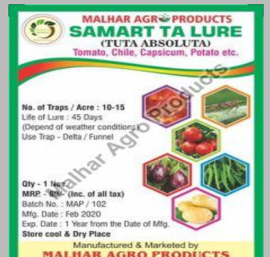
Smart TA Pheromone Lure