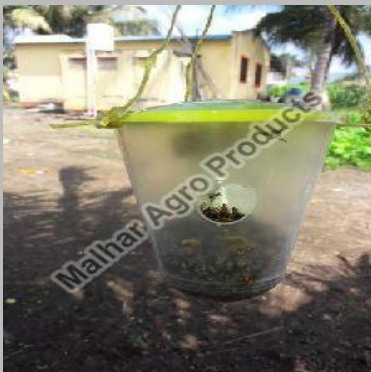
Fruit Fly Trap