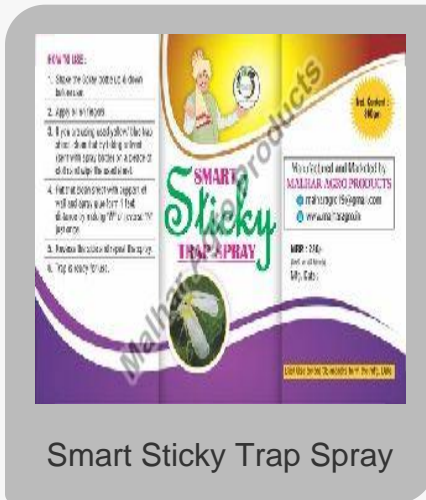
Smart Sticky Trap Spray