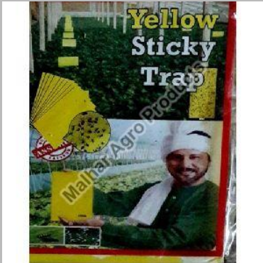
Yellow Sticky Trap