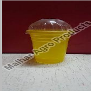
Melon Fruit Fly Trap