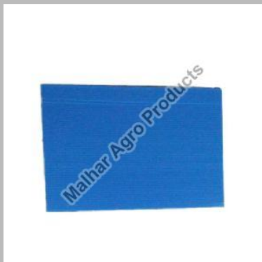
Blue Sticky Trap