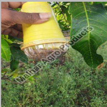
Melon Fly Trap