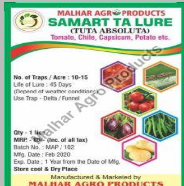
Smart TA Pheromone Lure