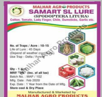
Smart SL Feromon Lure