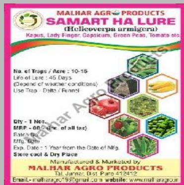
Smart HA Lure