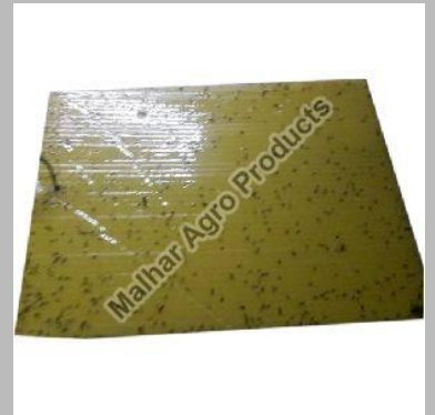
Bio Sticky Trap