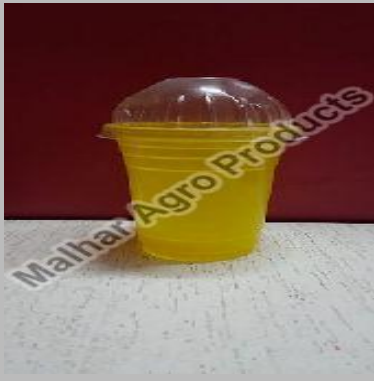
Melon Fruit Fly Trap

We Malhar Agro Products are a leading and distinguished Manufacturer and Supplier of quality Insect Trap, Mosquito and Insect Repellent, Solar Insect Trap and Solar Products.