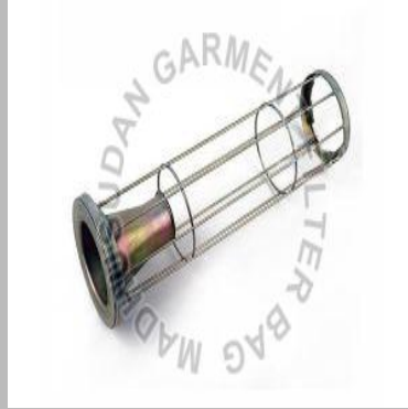
Dust Filter Bag Cage