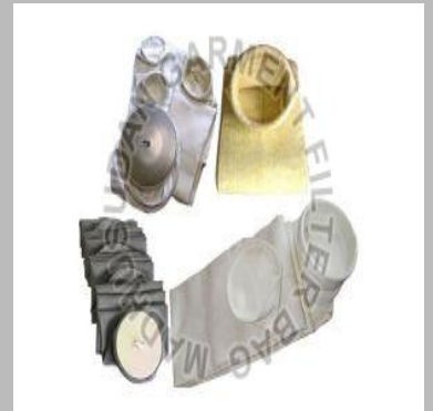
Fiber Glass Spray Dryer Bag