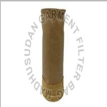
P84 Filter Bag