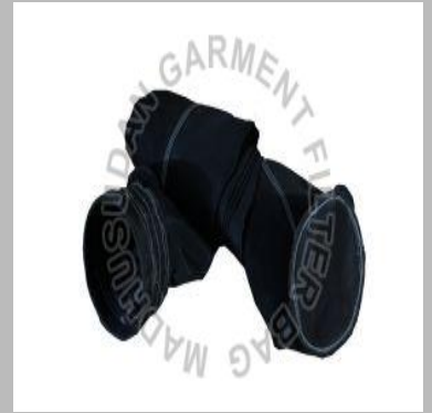
SGT Fiber Glass Filter Bag