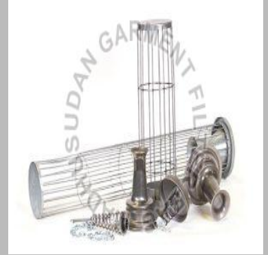
Cassette Filter Bag Cage