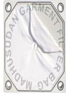
Butterfly Filter Bag