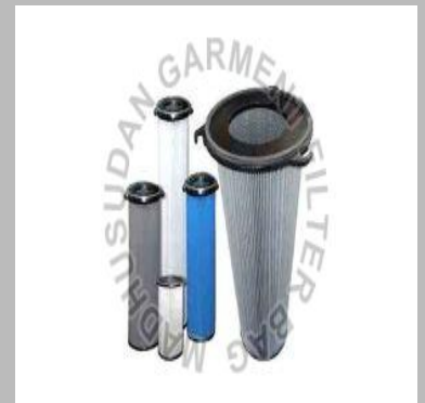
Dust Filter Cartridges