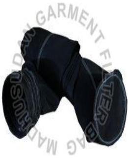
SGT Fiber Glass Filter Bag