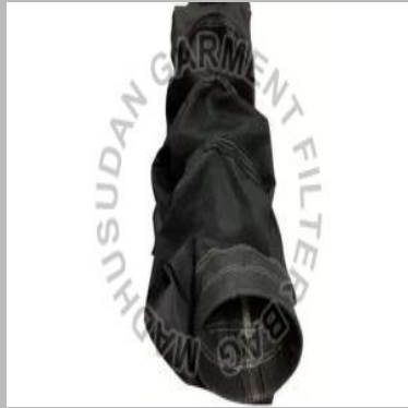
Fiber Glass Filter Bag