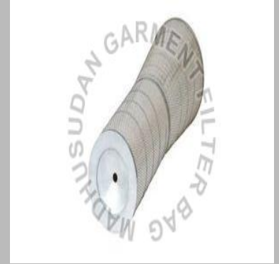
SFI Cylindrical Filter Cartridge