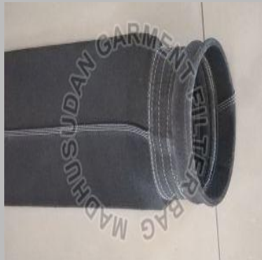
Double Snap Fiber Glass Filter Bag