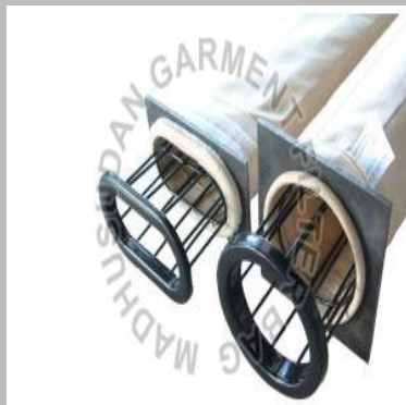
Oval Bag Filter Cage