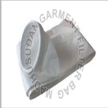
PTFE Needle Felt Filter Bag