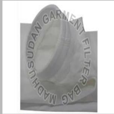
PTFE Membrane Filter Bag