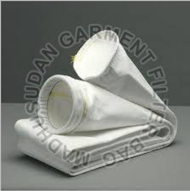
garment filter bag

We Madhusudan Garment Filter Bags are a leading and distinguished Manufacturer, Exporter, Supplier, Trader and Service Provider of quality Agricultural Bags, AIR Filters, AIR Pollution Control Equipment, Bag Filters and Bags.