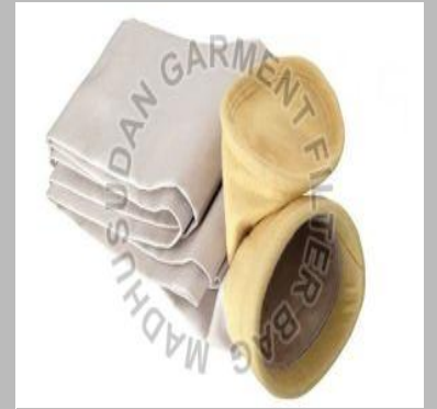
PTFE Membrane Fiber Glass Filter Bag