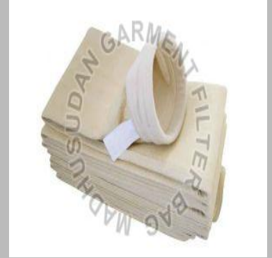
Ryton Filter Bag