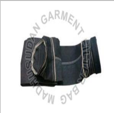
Glass Fiber Filter Bag