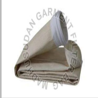
SFI Speco Asphalt Plant Filter Bag