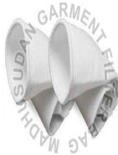
Non Woven Dust Filter Bag