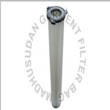
SFI Bag Filter Cartridge