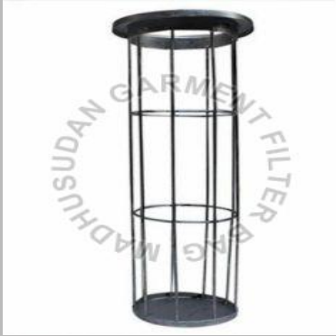
Filter Bag Cage