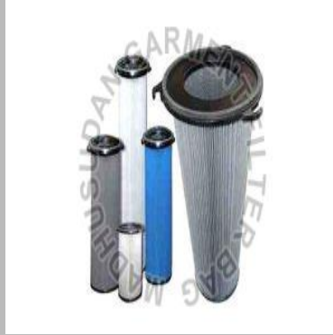
SFI Thread Filter Cartridge