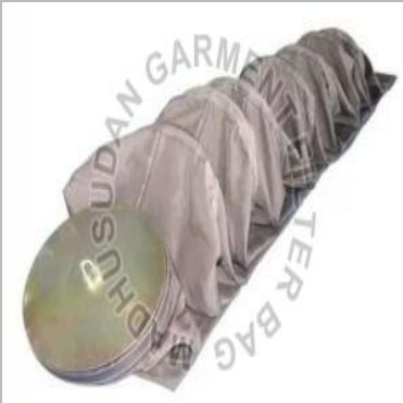
Filter Spray Dryer Bag