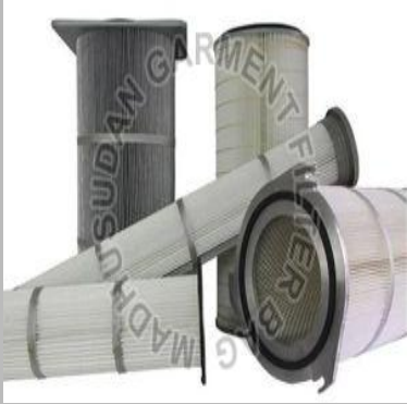
Three Lug Type Filter Cartridge