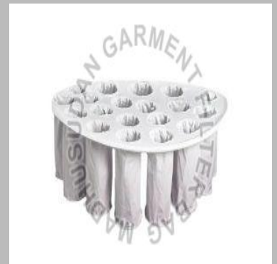
Mesh Filter Bag Non-Woven Bed Dryer Filter Bag