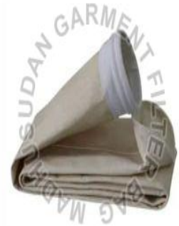
Nomex Filter Bag