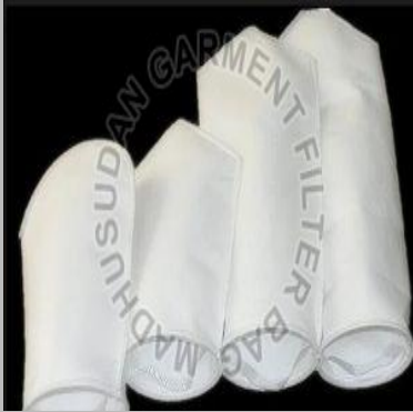
White Nylon Mesh Filter Bags