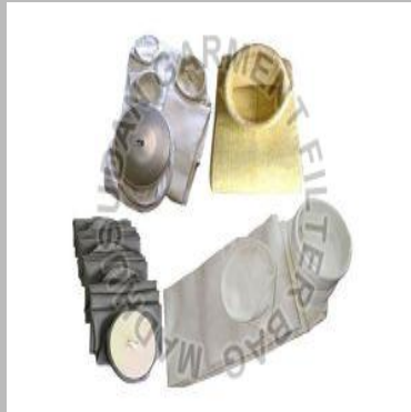
Fiber Glass Spray Dryer Bag