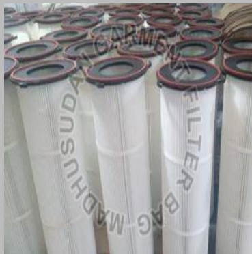
Powder Coating Filter Cartridge