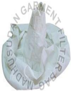
Pocket FBD Filter Bags