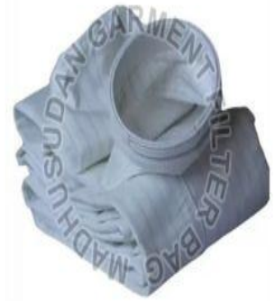
Polyester Filter Bag