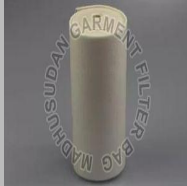
SFI Non Woven Filter Bag