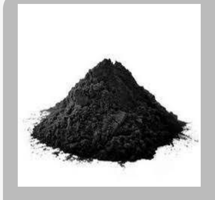
Shudh Kajli Bhasma