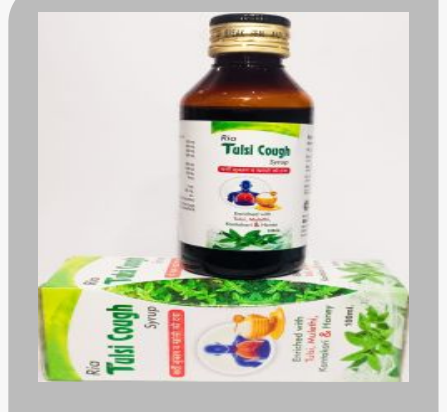
Tulsi Cough Syrup