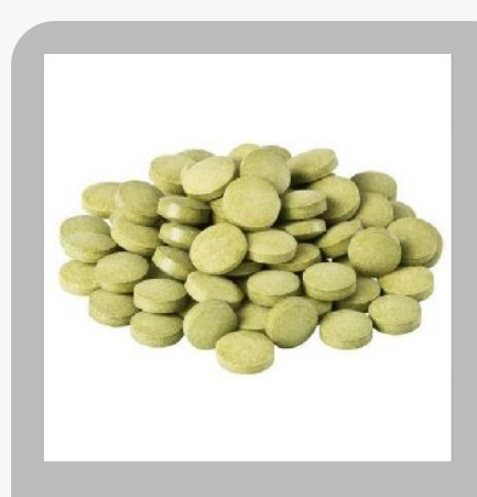
Gandhak Rasayan Tablet