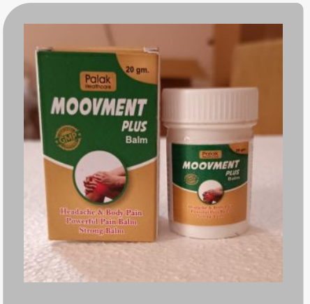
Moovment Plus Balm