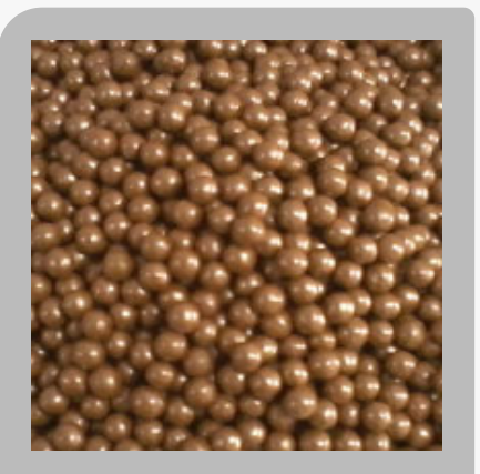
Chandraprabha Vati Golden Tablet