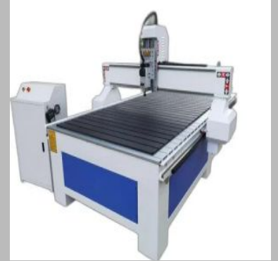
250mm Cnc Wood Router Machine