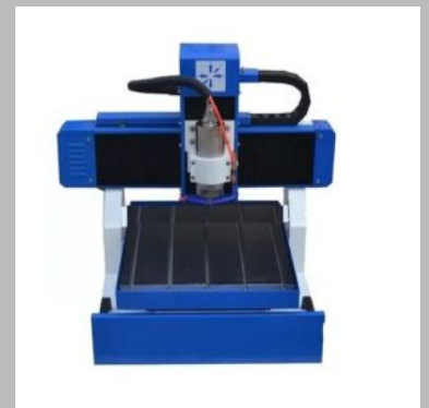
400x400mm Small CNC Engraving Machine