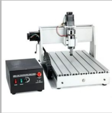
3 KW Mini CNC Engraving Machine