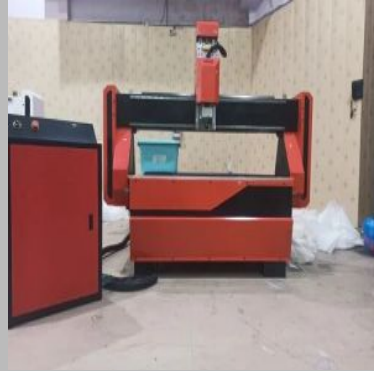
CNC Wood Engraving Machine