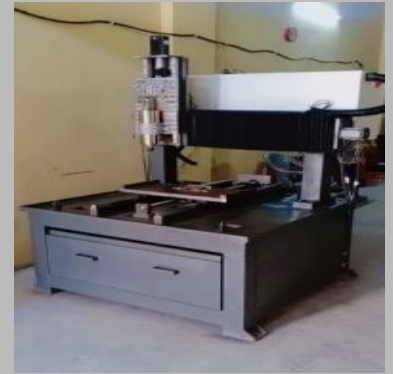
4.5kW CNC Metal Engraving Machine