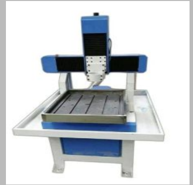
CNC Pantograph Engraving Machine