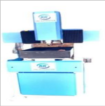
Single Phase Mini CNC Machine

We KR CNC AUTOMATION are a leading and distinguished Manufacturer, Exporter, Supplier, Trader and Service Provider of quality CNC and Lathe Machinery, CNC Machine, CNC Machine Spare, Grinding & Milling Tools & Machinery and Machinery Repairs.