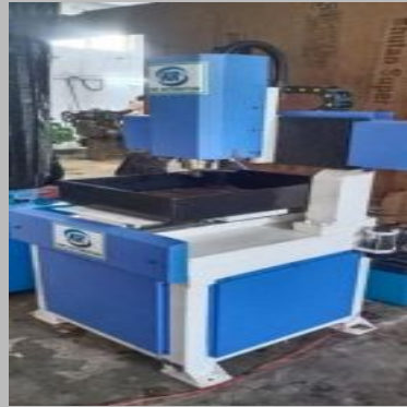
Mild Steel CNC Metal Engraving Machine