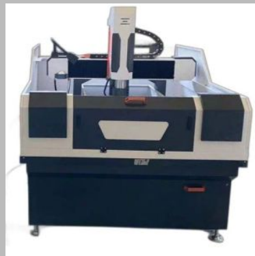
CNC Brass Engraving Machine