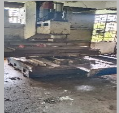
industrial used vmc machine repair and service