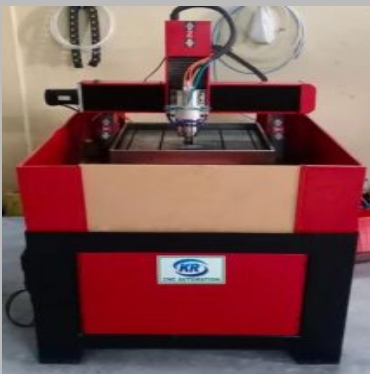
CNC Aluminium Engraving Machine