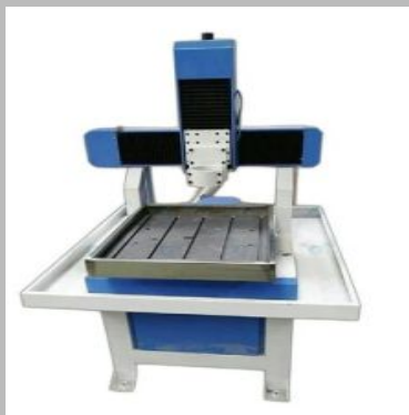
3kW CNC Copper Engraving Machine