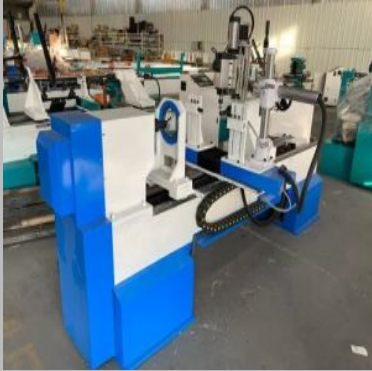
CNC Wood Lathe Machine