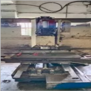
VMC Machining Service