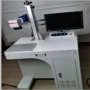
Metal Laser Marking Machine