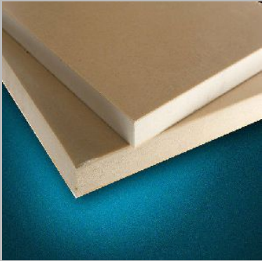
WPC Foam Board