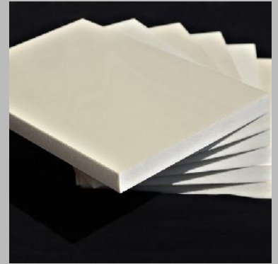
PVC Foam Board