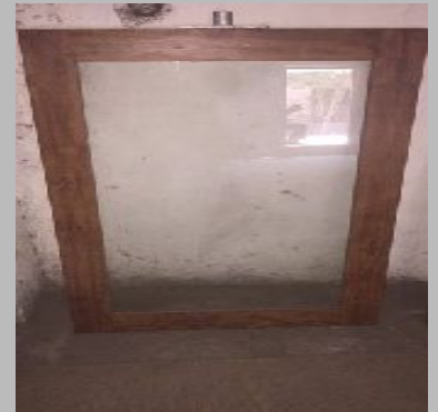
wpc window frame