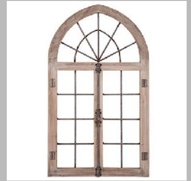
wpc door & window frame