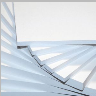
Polyvinyl Chloride Foam Board