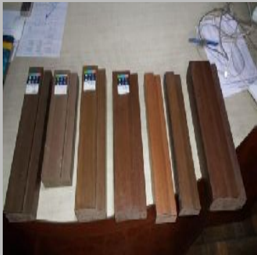
Rectangular Libero Window Frame