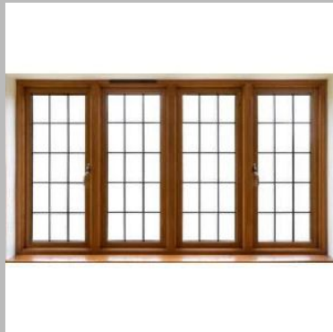
WPC Window Panel