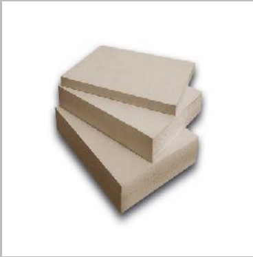
WPC Celuka Foam Board