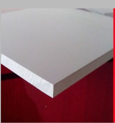
White PVC Sheet