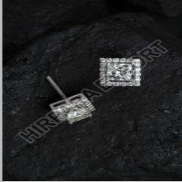
Designer Diamond Stud Earrings