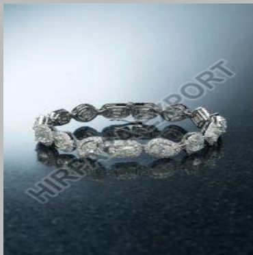
Modern Diamond Ring