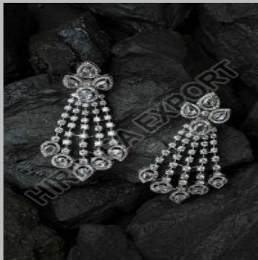
Designer Diamond Earrings