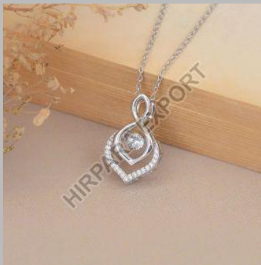
Designer Diamond Pendant