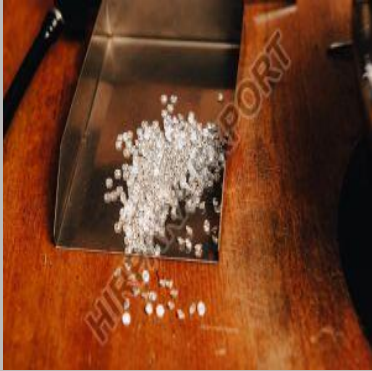
Star Melee Lab Grown Diamonds