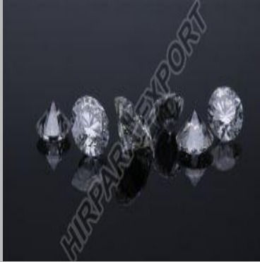
Round Shape Lab Grown Diamond