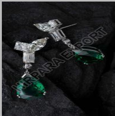
Fancy Green Diamond Earrings