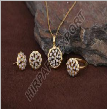
Fancy Diamond Pendant Set