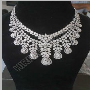
Real Diamond Necklace