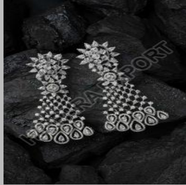
Stylish Diamond Earrings