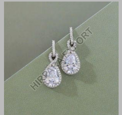
Real Diamond Earrings