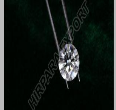
Round Cut Lab Grown Diamond