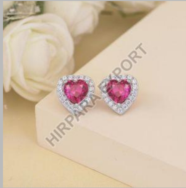
Heart Shape Diamond Stud Earrings