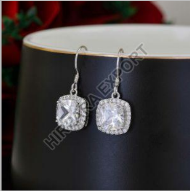
Square Diamond Earrings