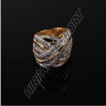
Stylish Diamond Ring