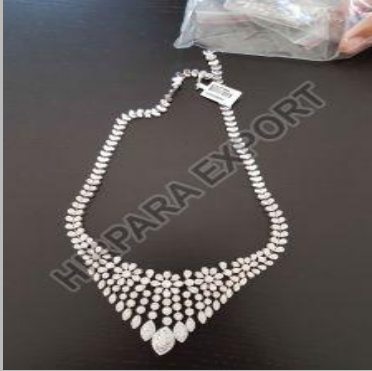
Stylish Diamond Necklace