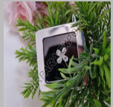
Pear Shape Lab Grown Diamond