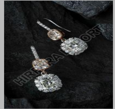
Modern Diamond Earrings