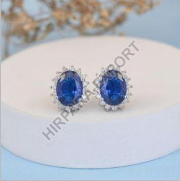
Blue Diamond Stud Earrings

We HIRPARA EXPORT are a leading and distinguished Manufacturer, Supplier and Trader of quality Designer Jewelry, Diamond Earrings, Diamond Jewellery, Diamond Rings and Diamonds.