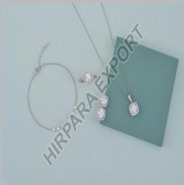
Designer Diamond Pendant Set