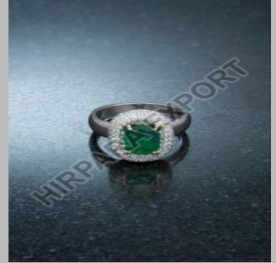
Green Diamond Ring