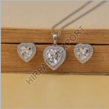
Heart Shape Diamond Pendant Set