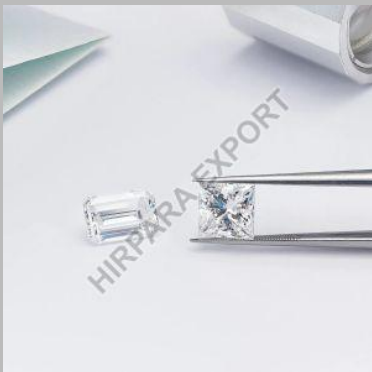
Princess and Baguette Lab Grown Diamond