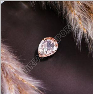
Pearl Shape Lab Grown Diamond