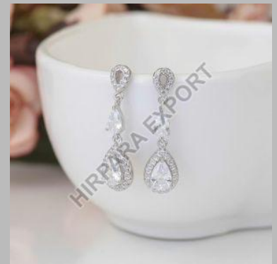
Elegant Diamond Earrings