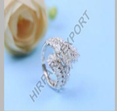
Antique Diamond Ring