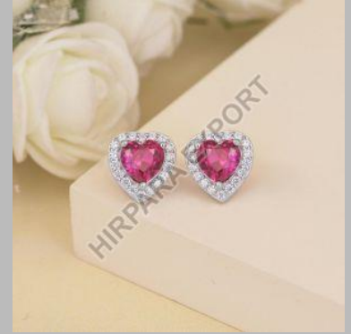
Heart Shape Diamond Stud Earrings