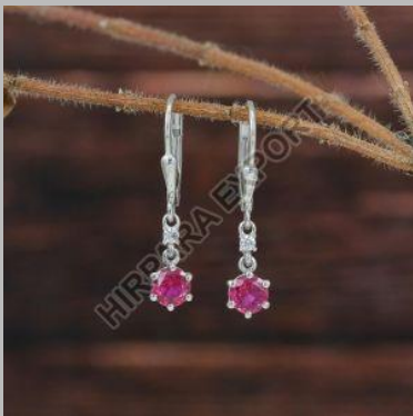
Fancy Pink Diamond Earrings