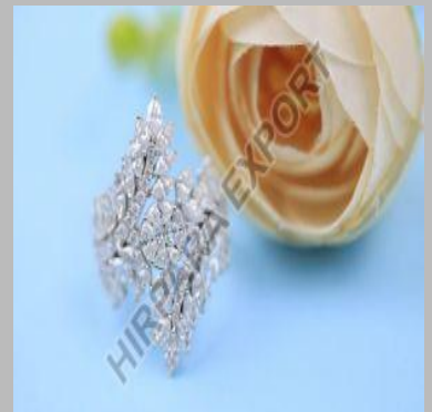
Engagement Diamond Ring