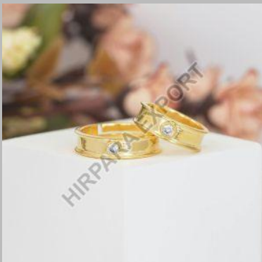
Golden Diamond Ring