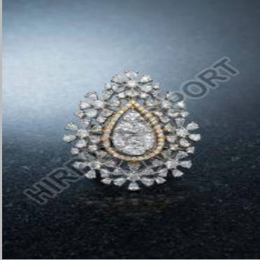
Ladies Diamond Ring