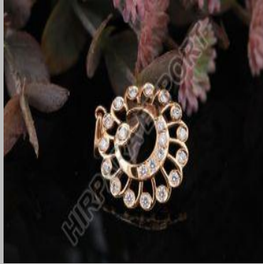
Peacock Design Diamond Ring