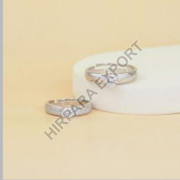
Couple Bands Diamond Ring