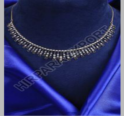
Square Pattern Diamond Necklace