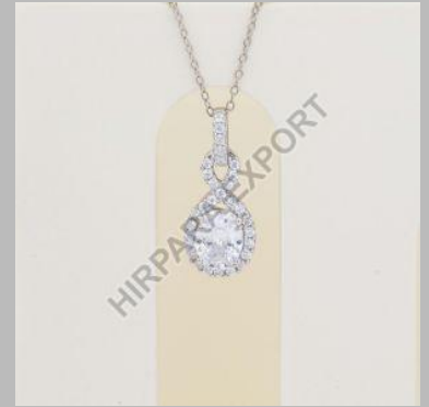
Fancy Diamond Pendant