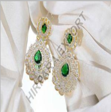
Party Wear Diamond Earrings