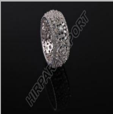
Real Diamond Ring