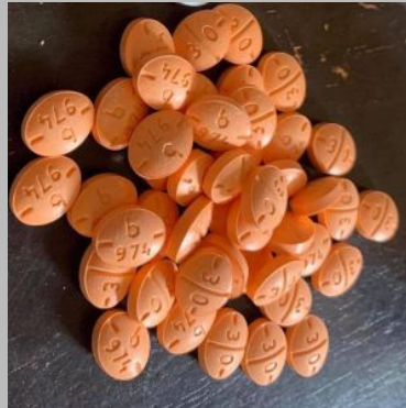
Adderall XR 30 MG Capsules