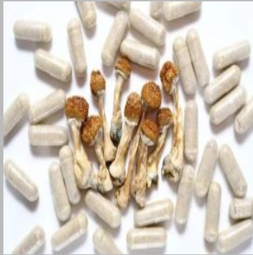
Exxua Gepirone Tablets