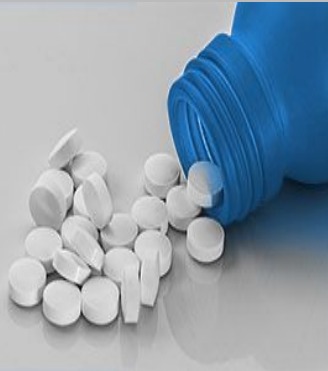
Tranlycypromine Sulfate Tablets