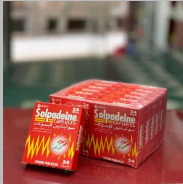
Solpadeine Soluble Tablets