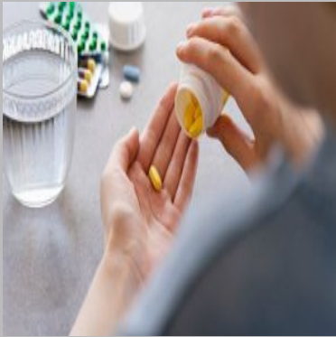
Gepirone Extended Release Tablets