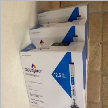
Mounjaro Tirzepatide Injection

We GNH India are a leading and distinguished Manufacturer, Exporter, Supplier, Retailer, Distributor, Importer and Trader of quality Antidiabetic Medicine, Arthritic Drugs, Industrial Chemicals, Liraglutide Injection and Nervous & Brain System Drugs.