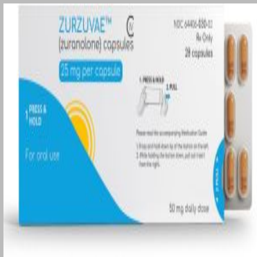
Zurzuvae Zuranolone Capsules