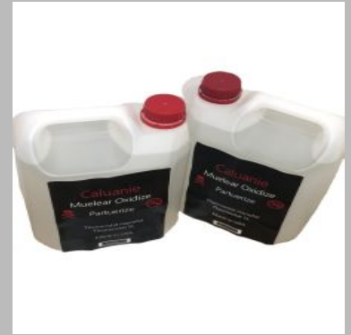
Caluanie Muelear Oxidize Liquid