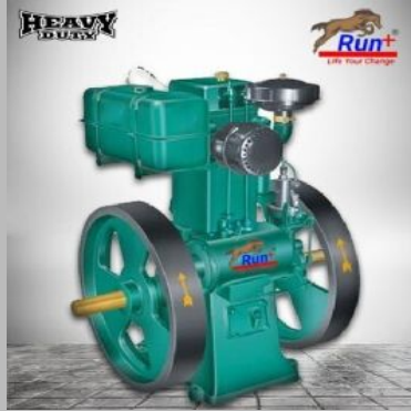
Lister Type Diesel Engine