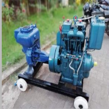
Dewatering Mud Pumps