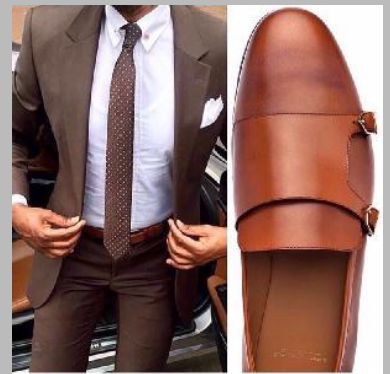
Mens formal Shoes