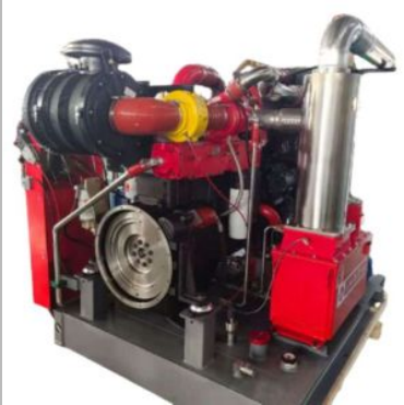
RUN+ 150 kw Atex Certificated Zone 2 Explosion Proof Diesel Engine