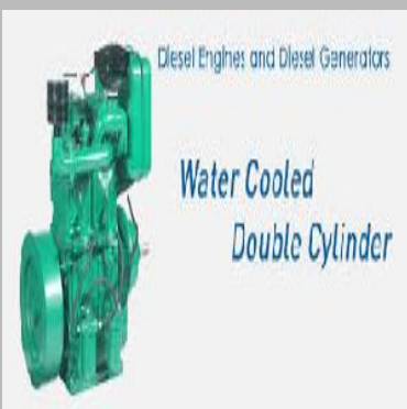
High Speed Water Cooled Double Cylinder