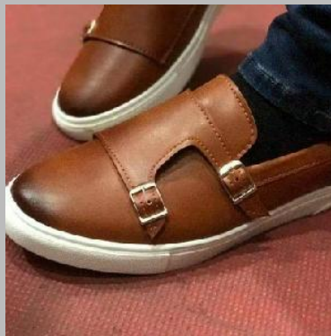
Mens Loafer Shoes