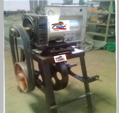
Tractor Mounted Alternator AC