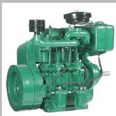
Air Cooled Double Cylinder Diesel Engine