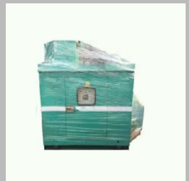
Silent Diesel Generator Set