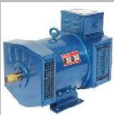
Single And Three Phase AC Alternator