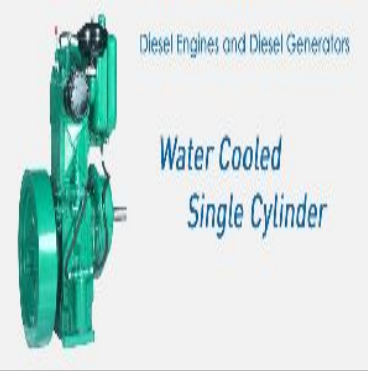
Water Cooled Diesel Engine