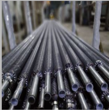
Crimped Fin Tube (Spiral Tension wound Fin Tube)