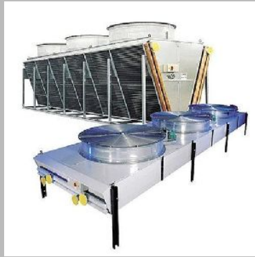
Air Cooled Heat Exchanger