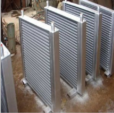
Stenter Machine Heat Exchanger