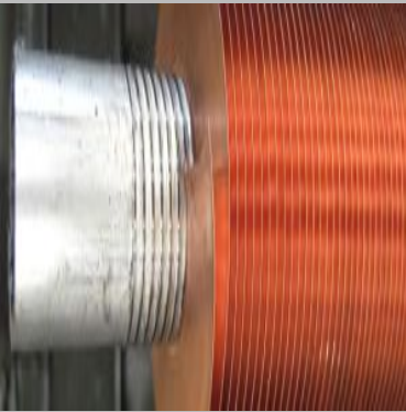
'G' FIN TUBES / EMBEDDED FIN TUBES