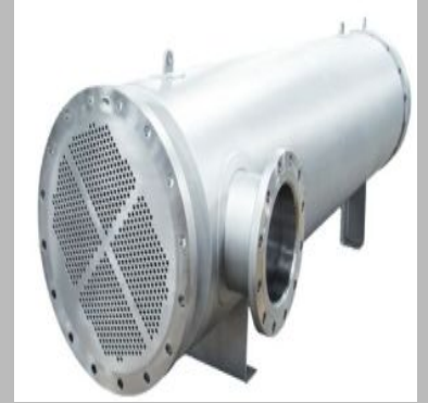
Shell & Tube Heat Exchanger