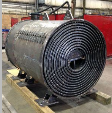
spiral heat exchanger