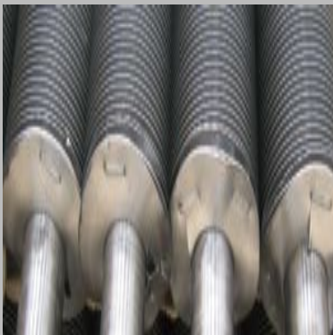
I fin tube, II fin tube