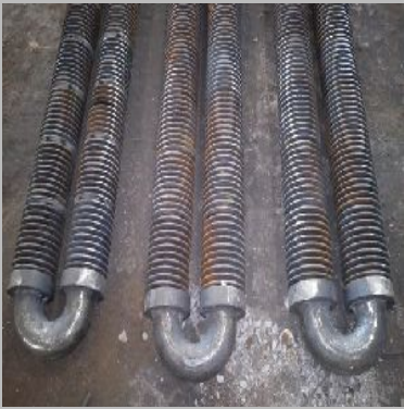
Fin Tube Economizer

Fitzer Incorporation is known as top Manufacturer, Exporter and Supplier of best Air Preheaters, Boiler and Boiler Parts, Boilers, Commercial Freezer and Cooling Tower.