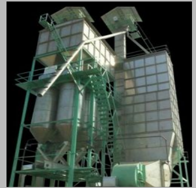
Paddy Dryer Heat Exchanger