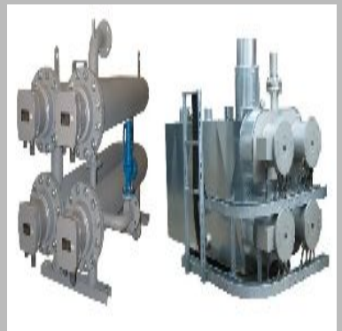
Heavy Fuel Oil Heater