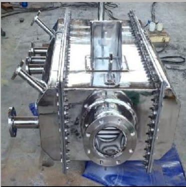
Box Type Heat Exchanger