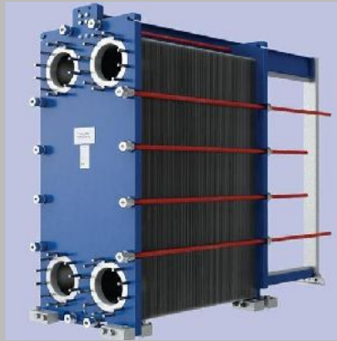
Pillow Type Plate Heat Exchanger