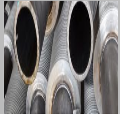
High Frequency Welded Fin Tube (Continuously Welded Spiral Fin Tube)