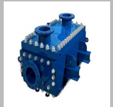
Fully Welded Plate Heat Exchanger