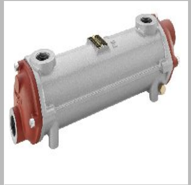
Marine Engine Oil Cooler