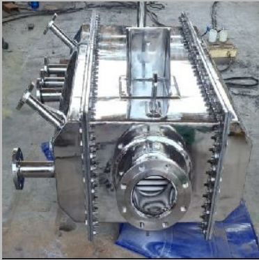
Box Type Heat Exchanger