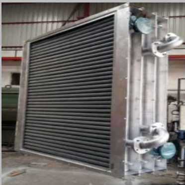
Rice Mill Heat Exchanger