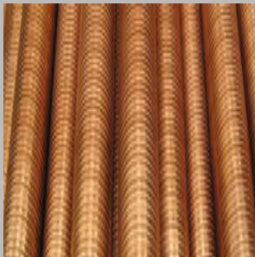
Low Integral Fin Tube