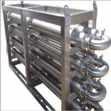
Tube in Tube Heat Exchanger