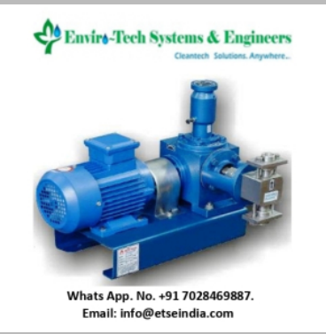
Chemical Dosing Tanks