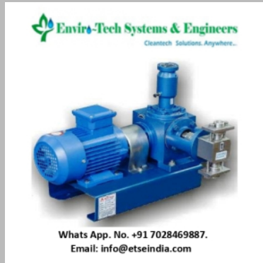
Chemical Dosing Tanks