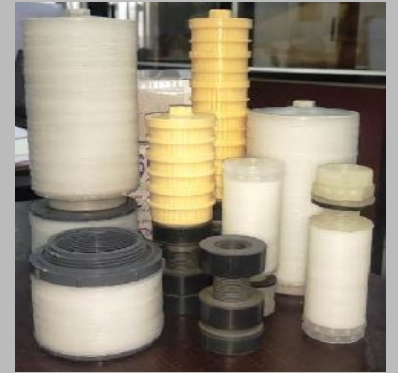
Water Distribution collection systems