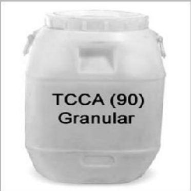
TCCA 90 Granules