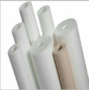
PP Spun Filter Cartridge

We Enviro Tech Systems & Engineers are a leading and distinguished Manufacturer, Exporter, Supplier, Retailer, Trader, Distributor, Importer, Buying House and Service Provider of quality Boiler and Boiler Parts, Cleaning Wipes & Liquids, Demineralisation Plants, Dosing pump and Filter Cartridges.