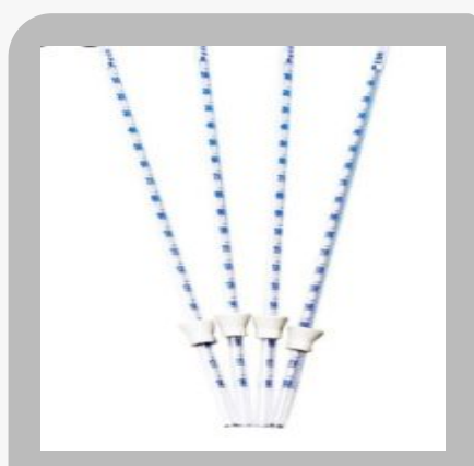
disposable esr pipette