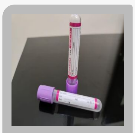
non vacuum blood collection tube