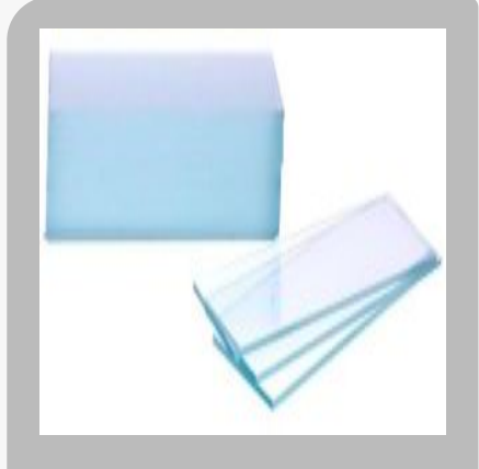
microscopic glass slides