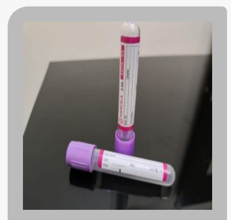
non vacuum blood collection tube