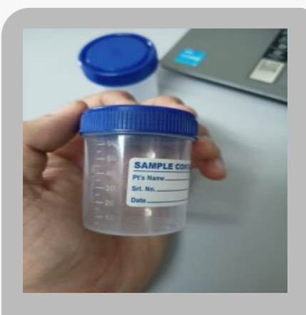
Urine Container 30ml

We DK International are a leading and distinguished Manufacturer, Exporter, Supplier, Trader, Distributor and Importer of quality Blood Collection Tubes, Centrifuge Machine, Chemiluminescence Analyzers, Glass Slides and Laboratory Plasticware.