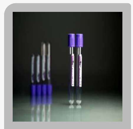
blood collection tubes