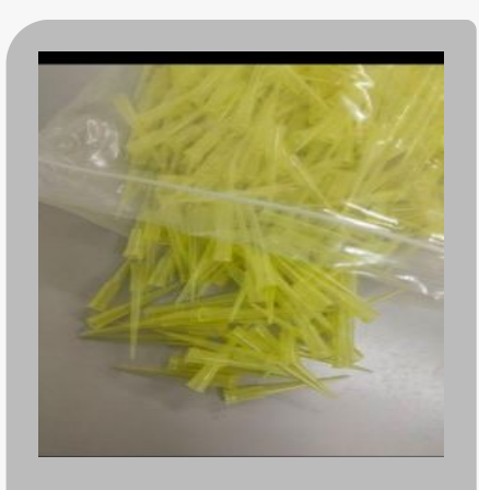
Gillson yellow tips