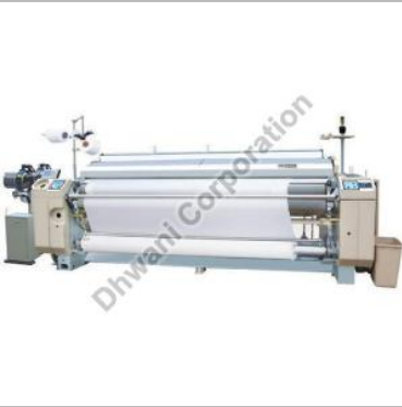
Water Jet Loom Machine