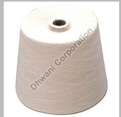
Carded Cotton Yarn