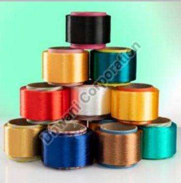
FDY Polyester Yarn