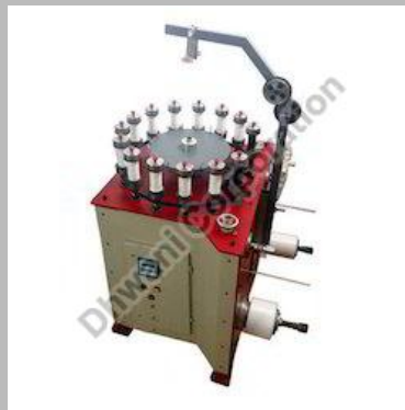
Monofilament Splitting Machine