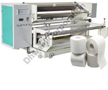
Spool Covering Machine