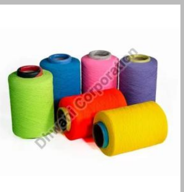
Covered Spandex Yarn