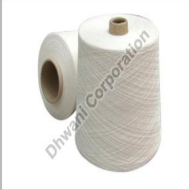
Raw Cotton Yarn