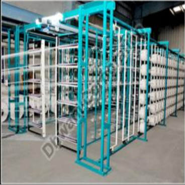
Technical Creel Machine