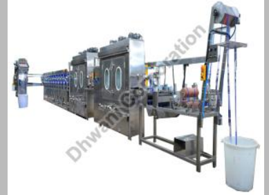
Tape Finishing Machine