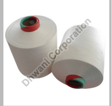
Open End Cotton Yarn