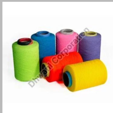
Covered Spandex Yarn