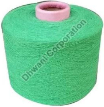
cotton lycra socks