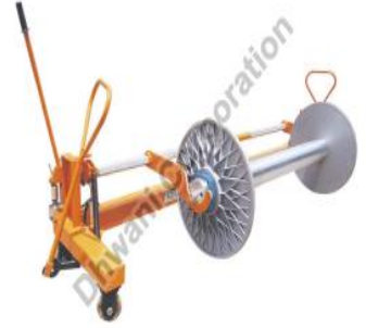
Textile Lifting Trolley