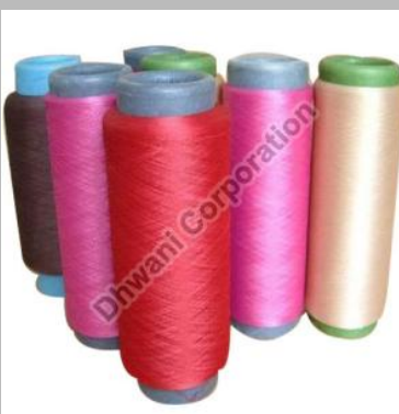
bare spandex yarn