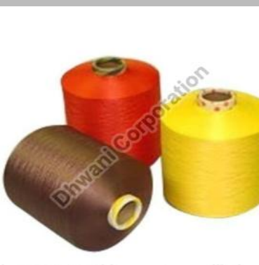
nylon lycra fabric