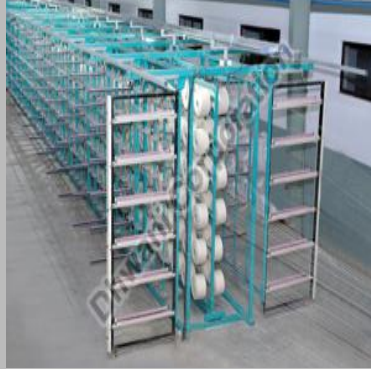
Revolving Type Manual Creel Machine