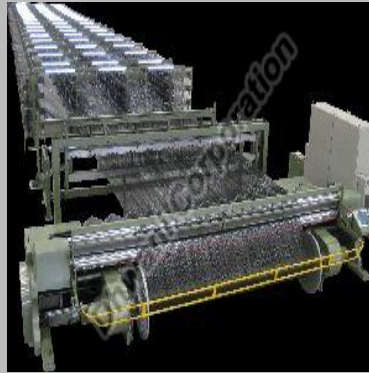
Technical Polybeamer Machine