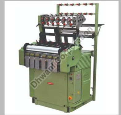
Needle Loom Warping Machine