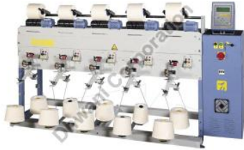
Yarn Winding Machine