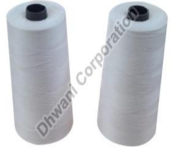
Micro Cotton Yarn