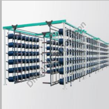
High Tension Yarn Creel Machine