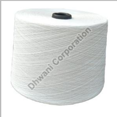
Contamination Free Cotton Yarn

Dhwani Corporation is known as top Manufacturer, Exporter, Supplier and Trader of best Cotton Yarn, Lycra Yarn, Polyester Yarn, Technical Textile Creel & Accessories and Textile Trolleys.