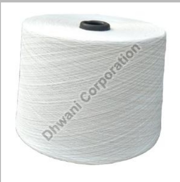
Contamination Free Cotton Yarn