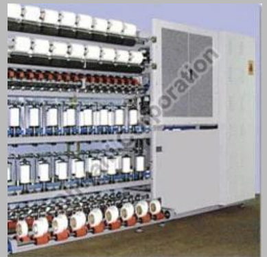
Rubber Covering Machine