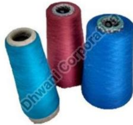
Blended Polyester Yarn