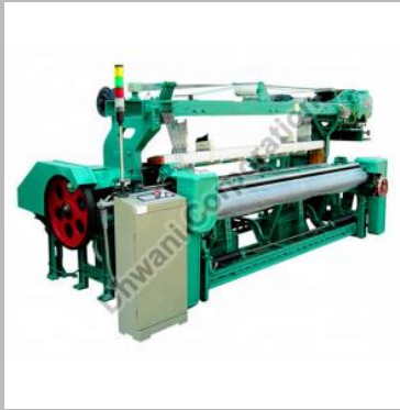
Rapier Loom Machine