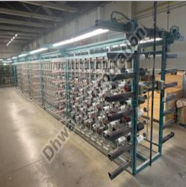
KFD Type Creel Machine