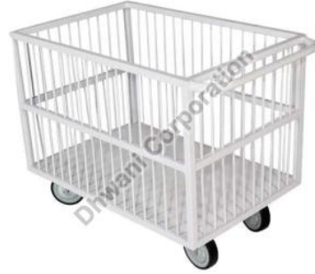
Textile Material Handling Trolley