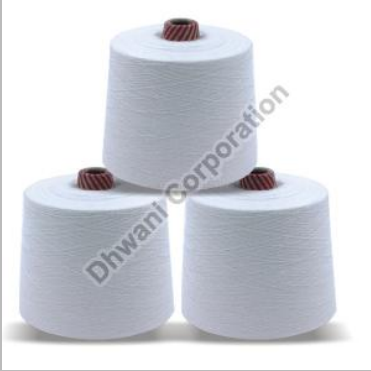
TFO Cotton Yarn