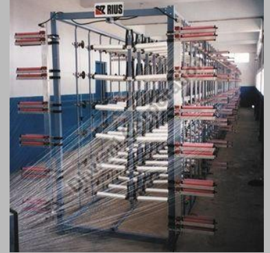
Monofilament Spool Creel Machine