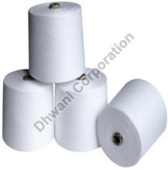
Poly Cotton Yarn