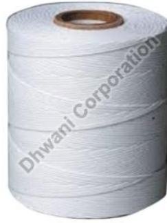
Modal Cotton Yarn