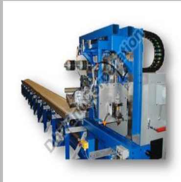
Tape Layering Machine