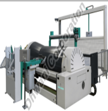
Monofilament Warping Machine