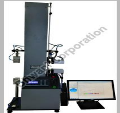
High Tenacity Yarn Tension Machine