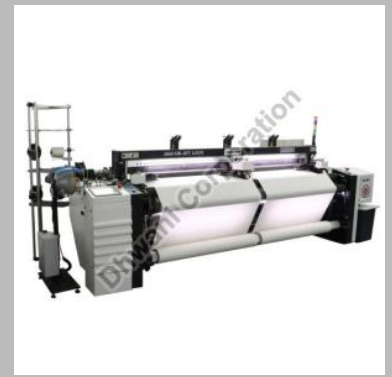
Air Jet Loom Machine