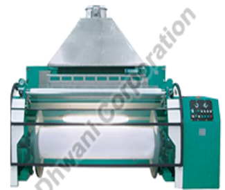
Filament Sizing Machine