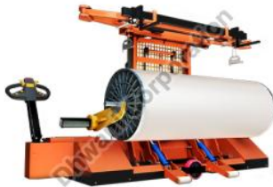
Beam Warping Machine