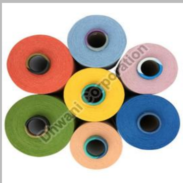
ATY Polyester Yarn