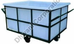
Textile Processing Trolley