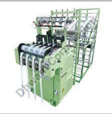
Needle Loom Warping Creel Machine