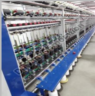
Spandex Covering Machine