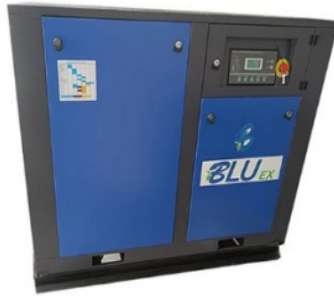
Screw Air Compressor