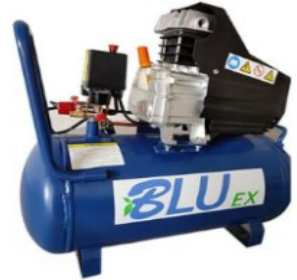
Lubricated Air Compressor