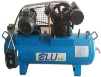
Two Stage Air Compressor