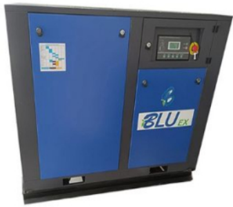
Screw Air Compressor

BLU EX AIR INNOVATIVE PRIVATE LIMITED is known as top Manufacturer, Exporter and Supplier of best AIR Compressor, AIR Purifiers, Chemical Reactors & Process Tanks, Dryers and Oil Free AIR Compressor.