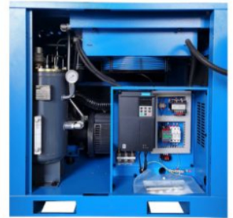
VSD Rotary Screw Air Compressor