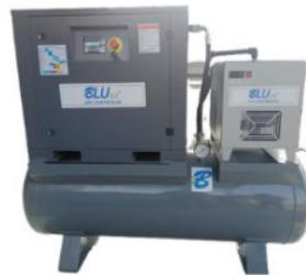
Fixed Speed Screw Air Compressor