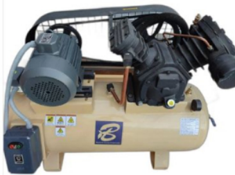
Industrial Air Compressor