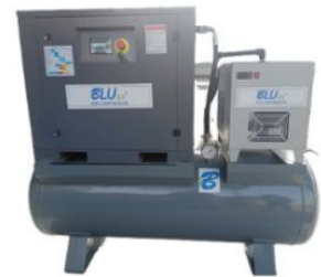
Fixed Speed Screw Air Compressor