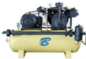
High Pressure Air Compressor