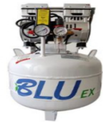
Dental Air Compressor