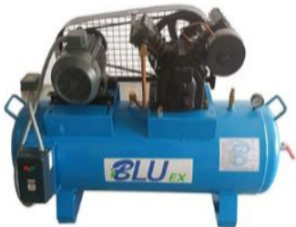
Two Stage Air Compressor