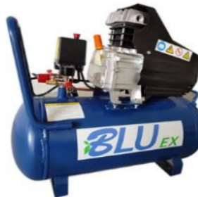
Lubricated Air Compressor