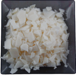
Hydrogenated Castor Oil Flakes