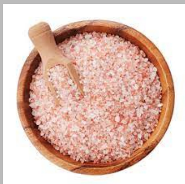
Himalayan Pink Salt