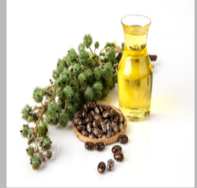
Cold Pressed Castor Oil