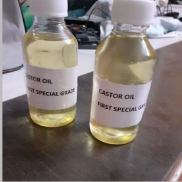
First Special Grade Castor Oil