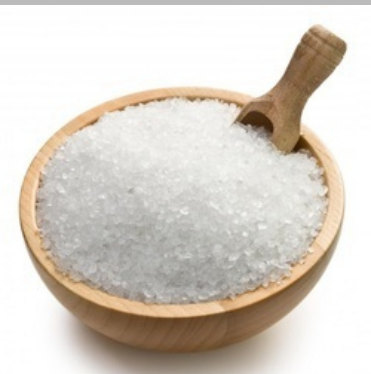
Free Flow Salt