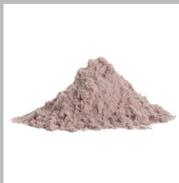
Black Salt Powder