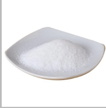
Triple Refined Salt