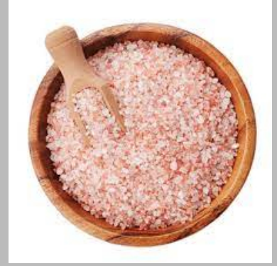
Himalayan Pink Salt