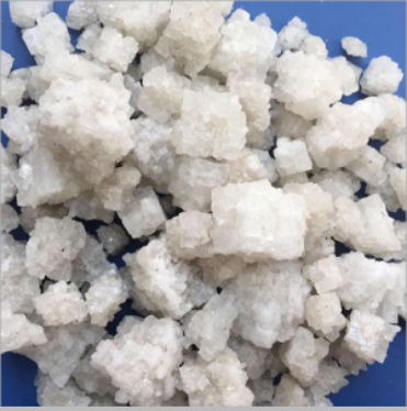
White Raw Salt