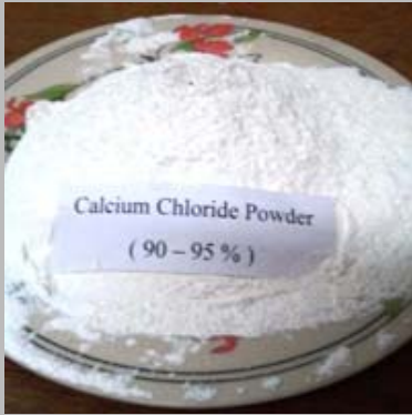
calcium chloride powder