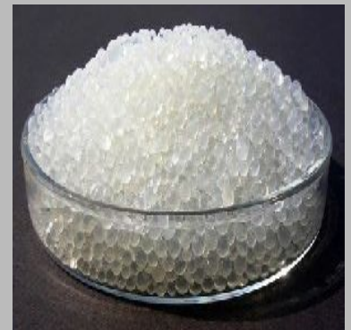
White Silica Gel Granules