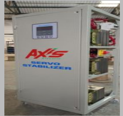
three phase servo controlled voltage stabilizer