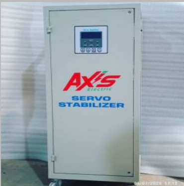
Static Voltage Stabilizer