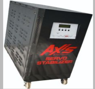
air cooled servo stabilizers