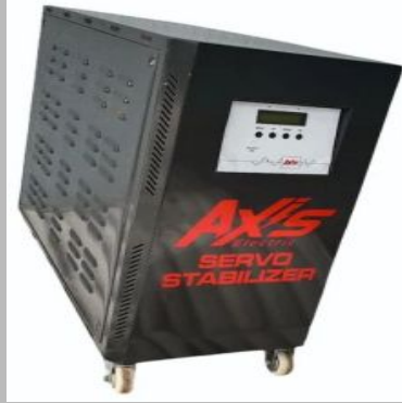
Servo Voltage Stabilizers