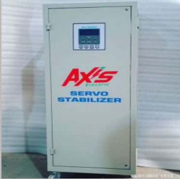
Static Voltage Stabilizer