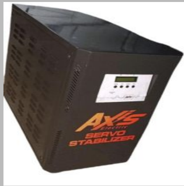
three phase servo-controlled voltage AIR COOLED stabilizer