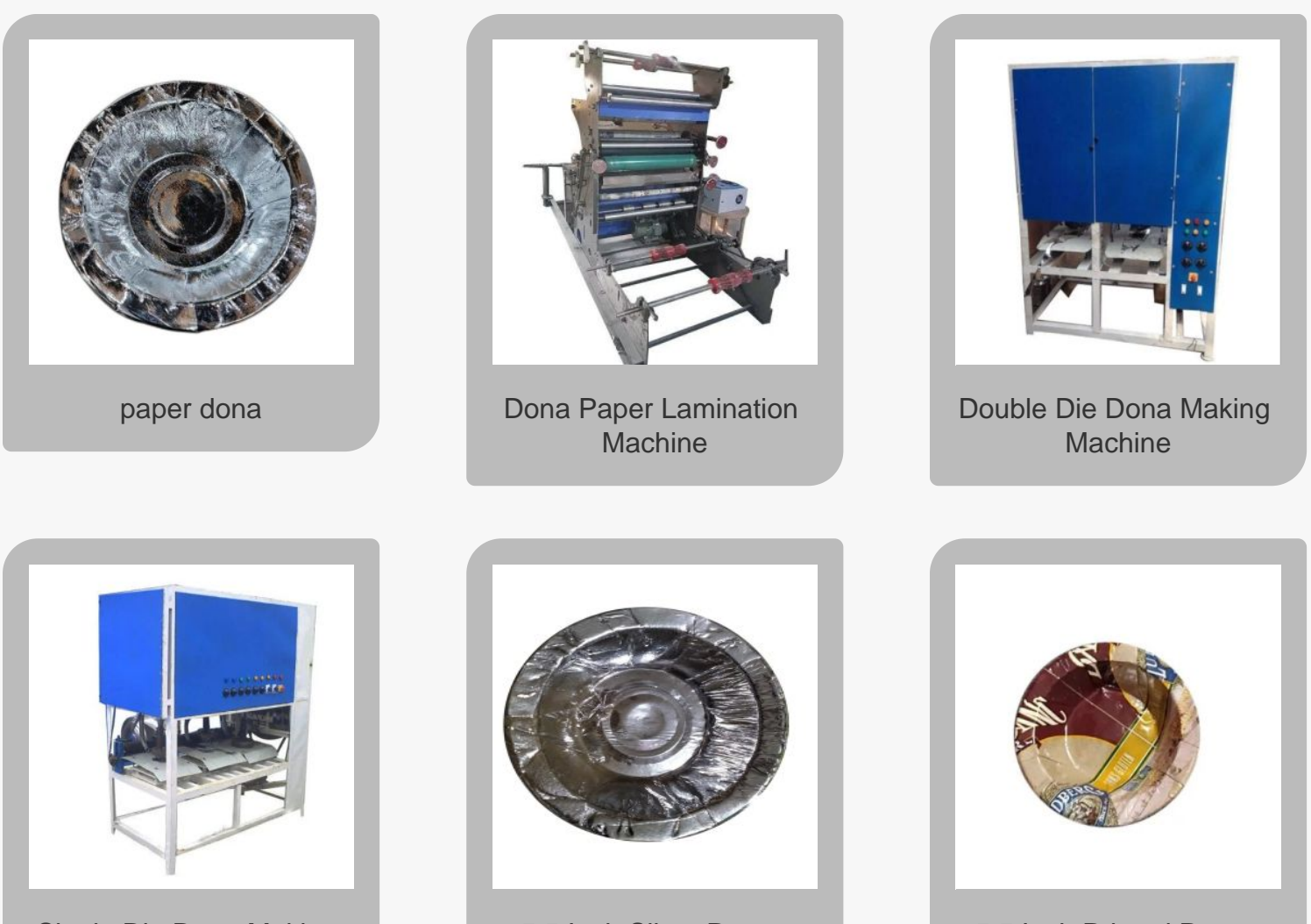
Single Die Dona Making Machine

We Katyayani Enterprises are a leading and distinguished Manufacturer and Supplier of quality Catering Equipment, Disposable Plate Making Machine, Disposable Utensils, Lamination Machine and Paper Bowls.